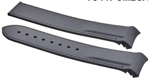
OM-11-20 20mm OM-11-22 22mm