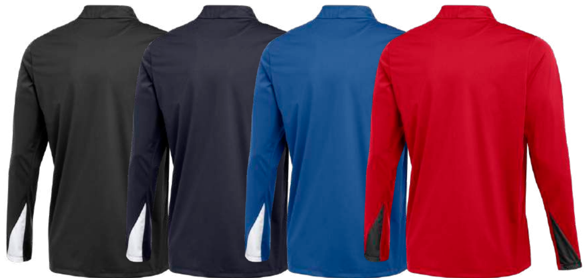
BACK VIEWS TO SHOW SLEEVE COLORS