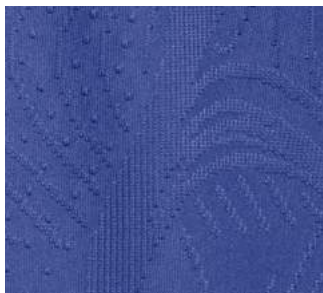
GRAPHIC KNIT DETAIL