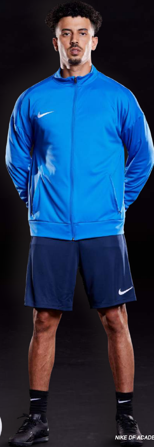
NIKE DF ACADEMY PRO 24 TRACK JACKET K FD7681, PAGE 36