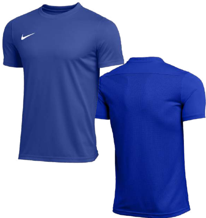
MESH BACK PANEL VIEW