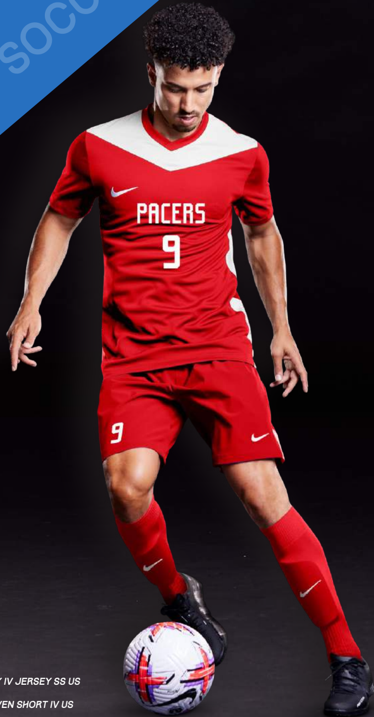
NIKE DF PARK DERBY IV JERSEY SS US FD7432, PAGE 12