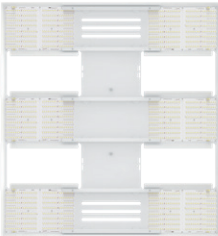
HLG SCORPION RSPEC FR Lamp