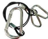
• Hanging hardware