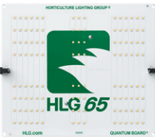
HLG 65 V2 Lamp