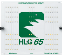
HLG 65 V2 Lamp