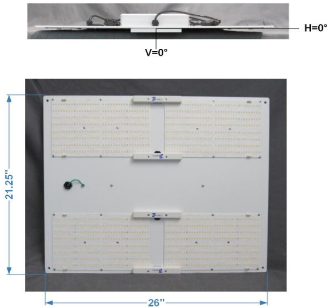
FIG. 1 LUMINAIRE