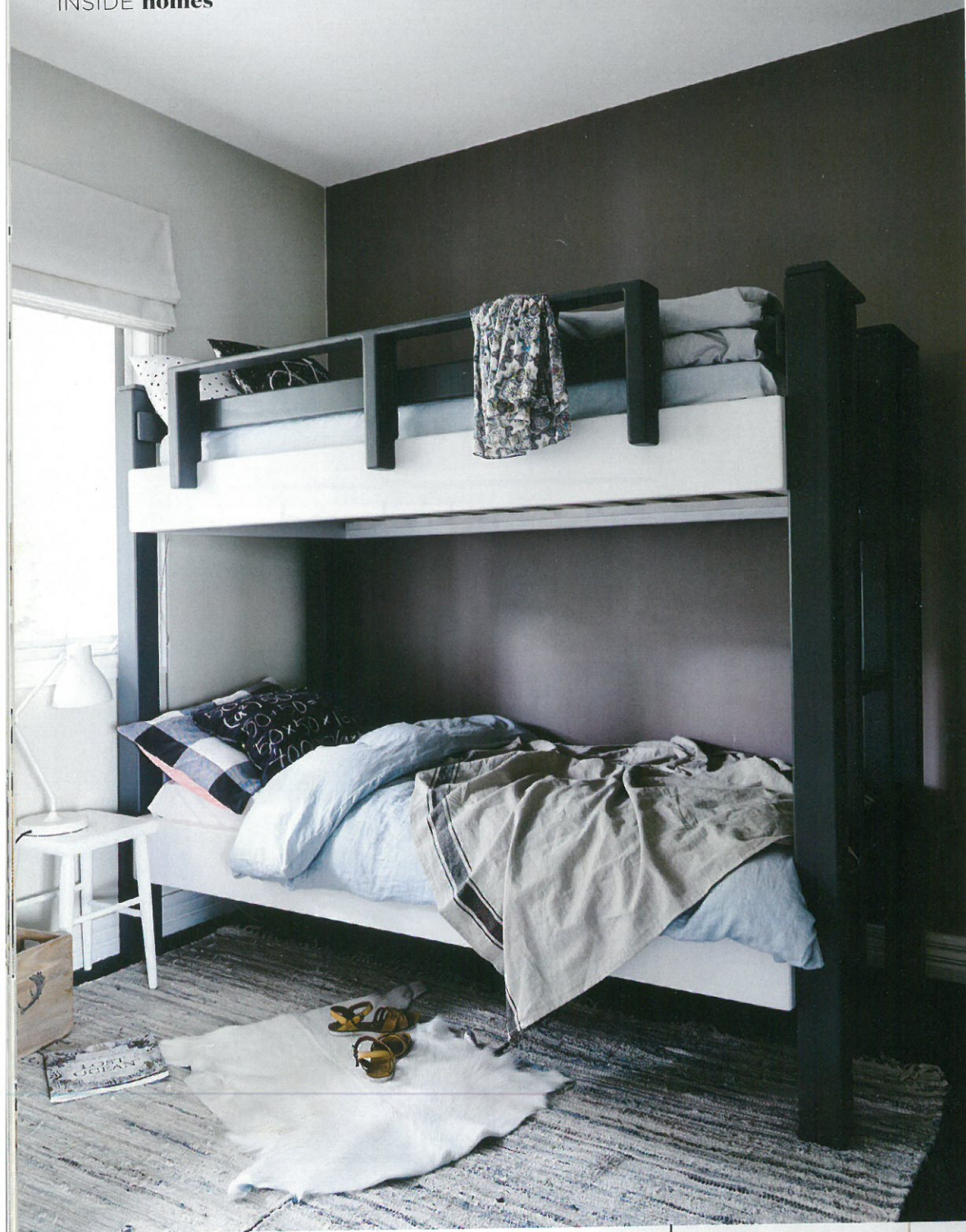
NINA'S BEDROOM (left) A 'Frankie' bunk bed from House Of Orange was a natural choice for accommodating the many friends that come to stay. The retro-style stool is from HK Living. DECK This area is where the family spends a majority of their time. "You walk through the hallway and out the doors and bang, there's that view," says Ursula. A House Of Orange table provides an outdoor dining option.