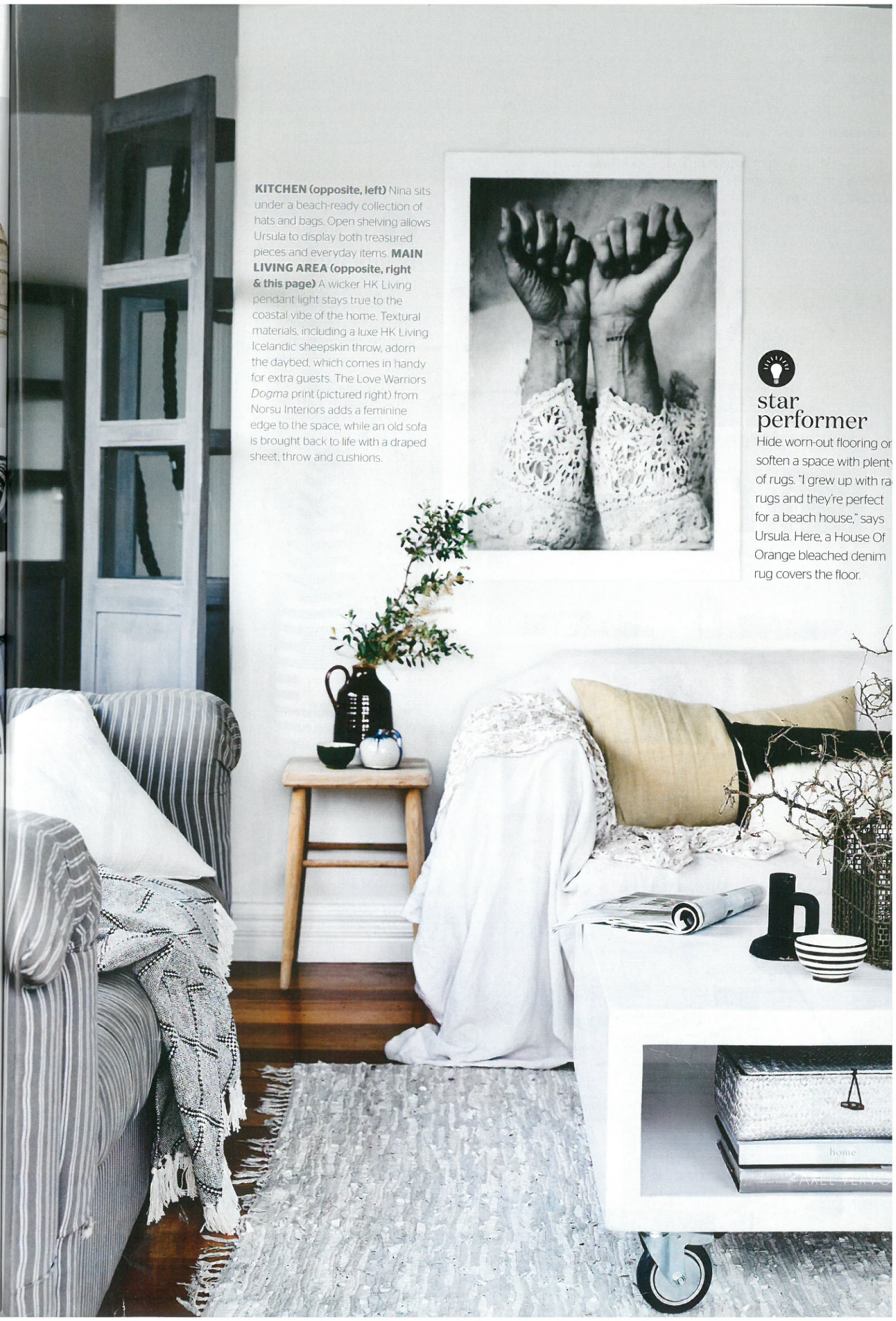
KITCHEN (opposite, left) Nina sits under a beach-ready collection of hats and bags. Open shelving allows Ursula to display both treasured pieces and everyday items. MAIN LIVING AREA (opposite, right & this page) A wicker HK Living pendant light stays true to the coastal vibe of the home. Textural materials, including a luxe HK Living Icelandic sheepskin throw, adorn the daybed, which comes in handy for extra guests. The Love Warriors Dogma print (pictured right) from Norsu Interiors adds a feminine edge to the space, while an old sofa is brought back to life with a draped sheet, throw and cushions.