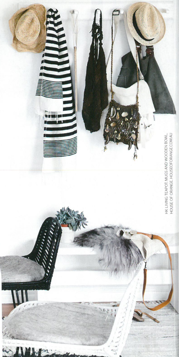
HK LIVING TEAPOT, MUGS AND WOODEN BOWL, HOUSE OF ORANGE, HOUSEFORORANGE.COM.AU