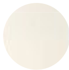
New Dutch Blonde