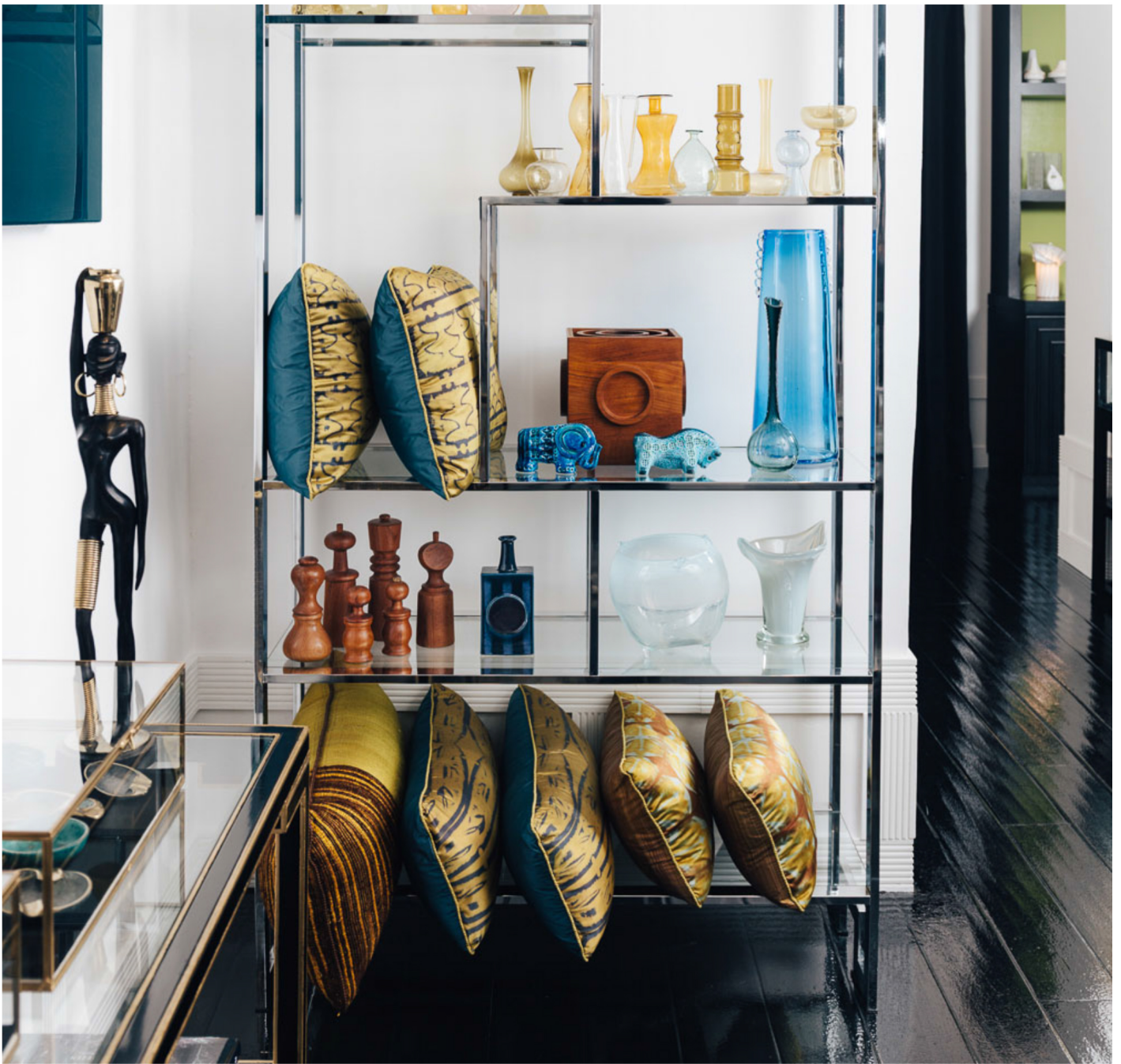
Shelves filled with luxe treasures