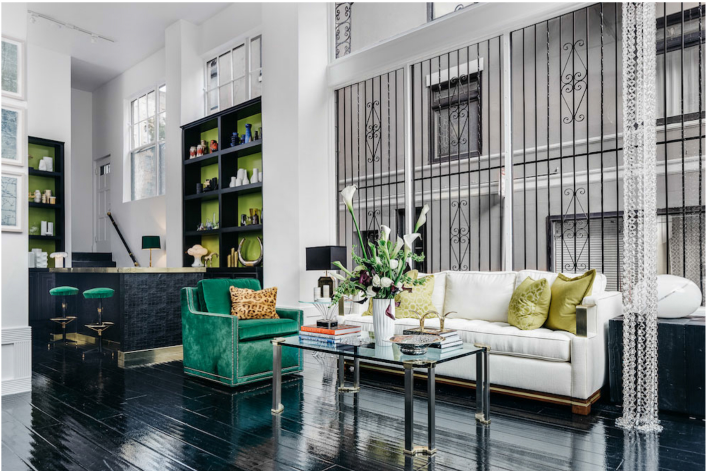
Black floors make colorful accents pop at Adeeni Design Galerie

BY KATIE SWEENEY | DESIGN & DECOR, NEWS |