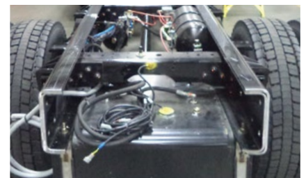
Double channel, heat treated frame rails