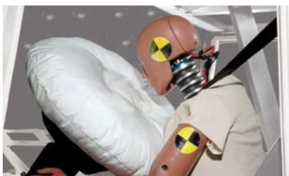
CAP+ Complete Airbag Protection