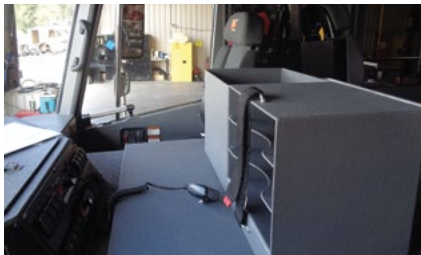
Custom map book holders