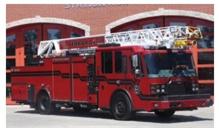
Black out package