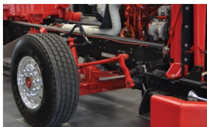
F-Shield Corrosion Protection