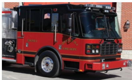
Barrier cab doors