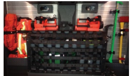
Custom wall equipment storage