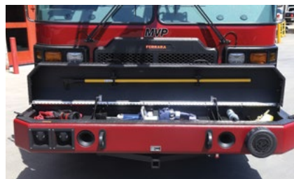
Custom front bumper storage, hose and equipment