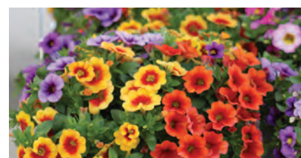
Confetti Garden® Kona Hawaiian Gold