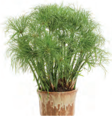
Cyperus - Graceful Grasses® Prince Tut™