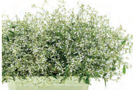
Euphorbia - Diamond Frost®