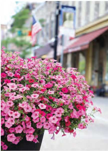
Petunia - Supertunia Vista® Series