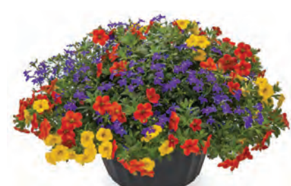
Kwik Kombos™ Harvest Moon™