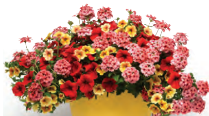
Trixi® Who Knew Orleans