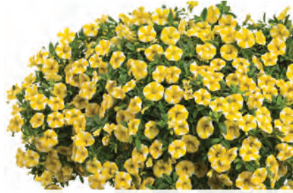
Calibrachoa - Superbells® Lemon Slice®