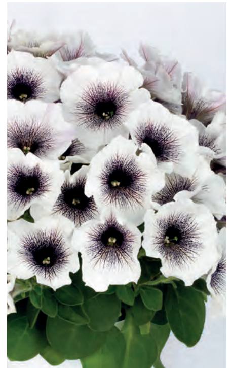
Petunia - Crazytunia® Black and White