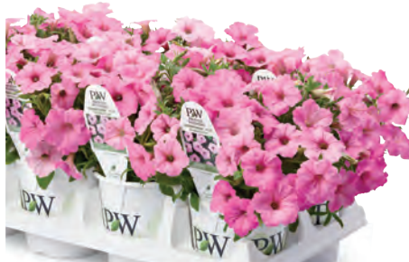
Petunia - Supertunia Vista® Bubblegum®