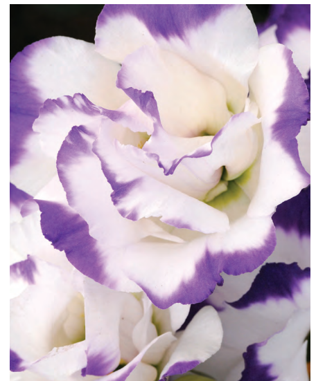
Lisianthus - ABC™ 2 Blue Rim

Visit harrisseed.com/Raker-Robertas for information on products, tray sizes, minimums, and shipping.