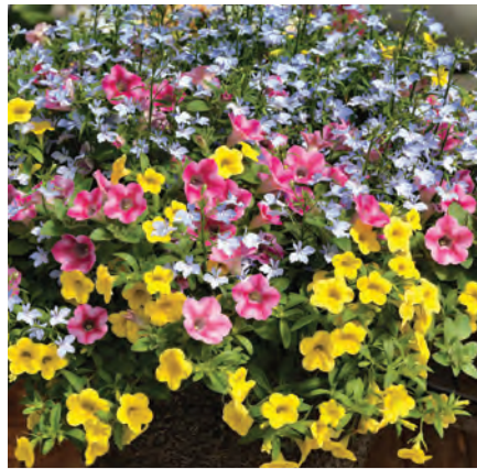
Kwik Kombos™ Pink Lemonade™