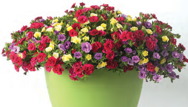
Trixi® Double Date

Mast Young and Pleasant View Gardens take on the high energy costs, while they prestart your pots and hanging baskets for you. Pots and containers arrive to your greenhouse for you to grow on for a few weeks for quick turnaround. Just a few weeks to sales, and with low minimums per variety so your customers get a better mix of varieties while you keep your inventory limited. Orders must be placed by end of November.