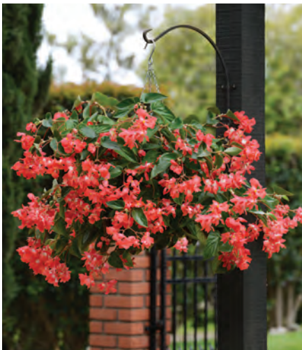
Begonia - Dragon Wing® Red