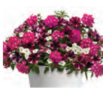
Trixi® Raspberry Sorbet