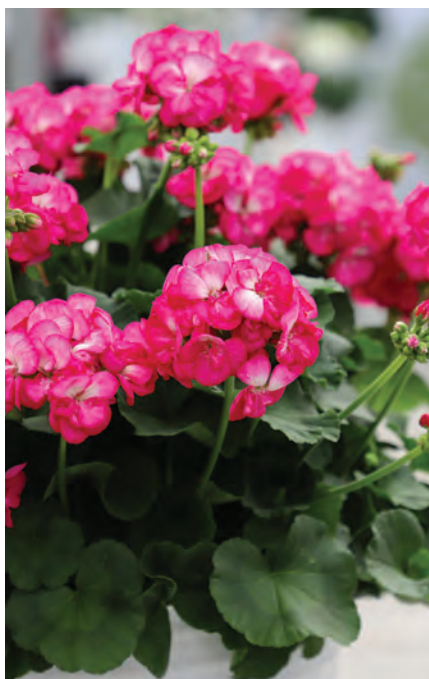
Geranium Americana® Violet Ice