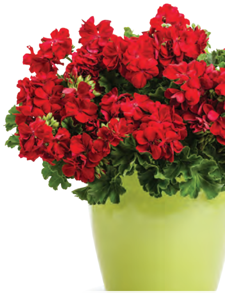
Geranium Boldly® Dark Red