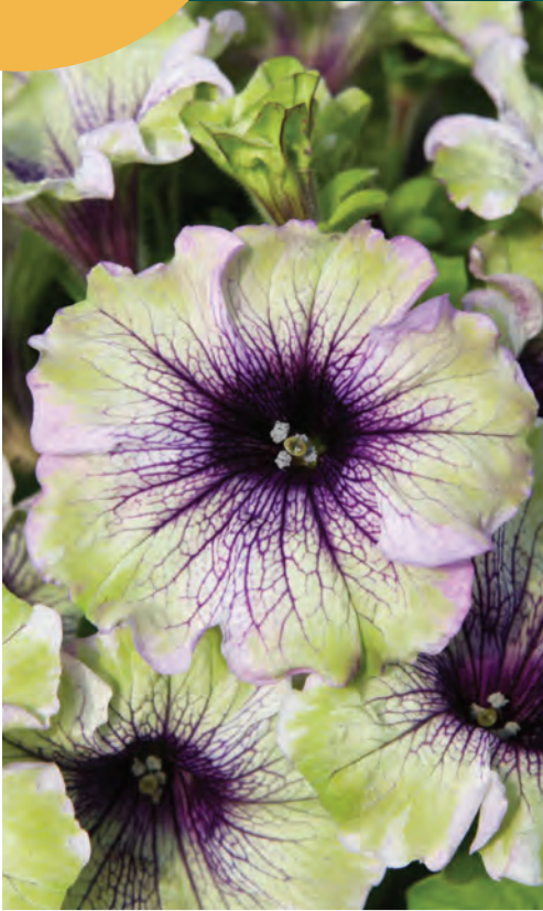
Petunia - Amazonas™ Plum Cockatoo