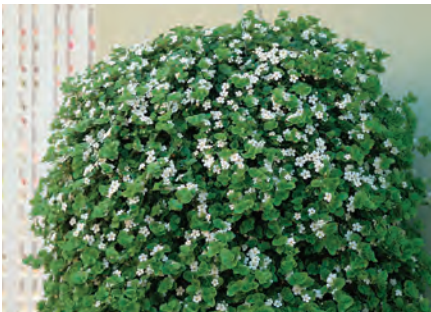
Bacopa - Snowstorm® Giant Snowflake®