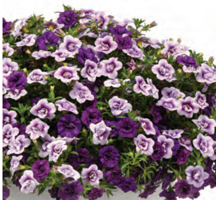
Calibrachoa- Minifamous® Series