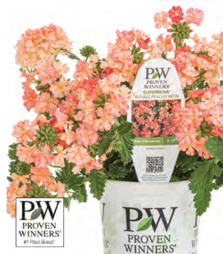
Verbena Superbena® Series

Growers limited on space, looking to reduce production time, or looking for unique additions to their product line turn to plugs and liners. These products are ideal additions to complement your seed offering.