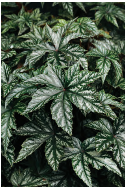
Begonia - Gryphon