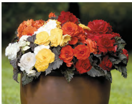
Begonia Nonstop® Series

Popular colors: Bicolor, pink, and purple