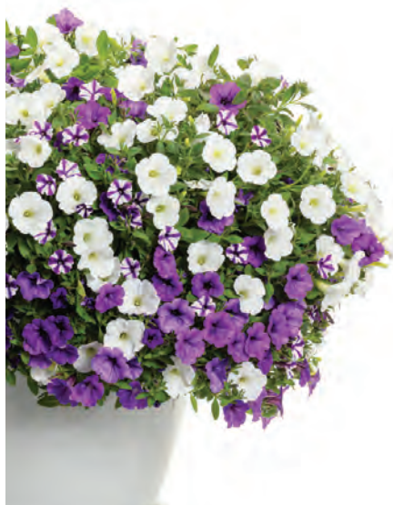
Misty Seas Recipe