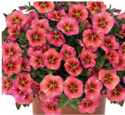
Calibrachoa - TikTok® Apricot