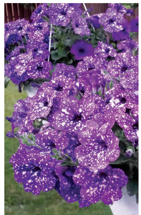
Petunia - Headliner™ Night Sky®