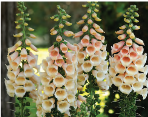
Digitalis - Dalmatian Peach