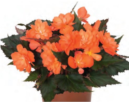
Begonia - l'Conia® First Kiss Orange

Adding to the wild range or 'colors' in this series, this Crazytunia features an upright habit with dense green foliage, large dazzling white blooms, and a deep black center. This Gothic beauty is one of a kind!