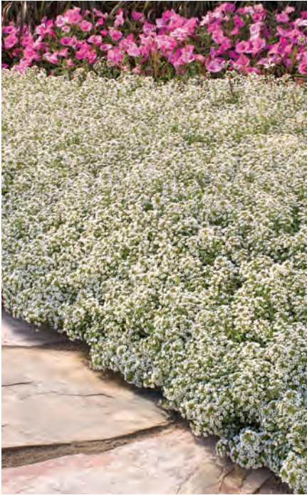
Alyssum - Snow Princess®