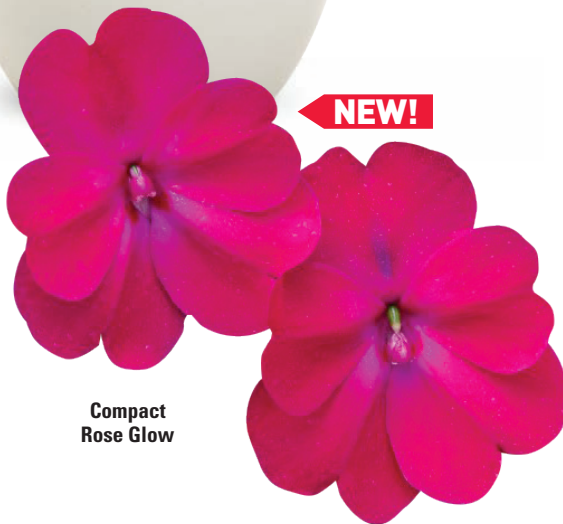
Compact Rose Glow