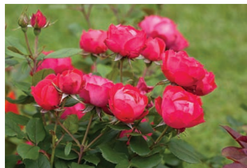
Rose - Oso Easy Double Red®