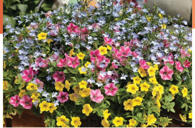
Kwik Kombos™ Pink Lemonade™ Mix