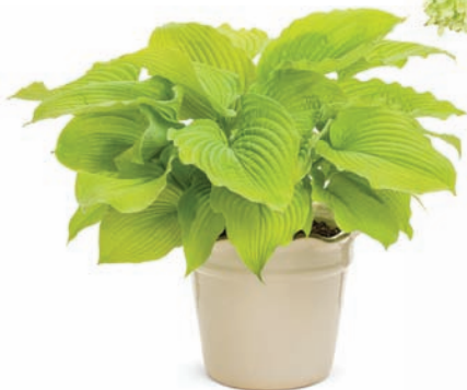
Hosta - Shadowland® Coast to Coast