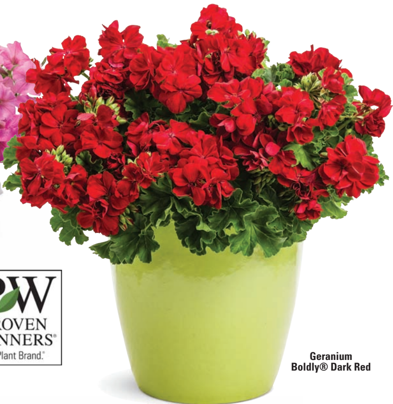
Geranium Boldly® Dark Red