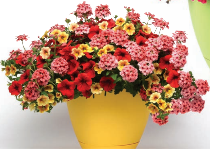
Trixi® Who Knew Orleans