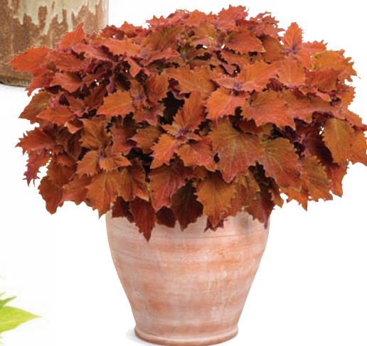
Coleus - ColorBlaze® Wicked Hot™