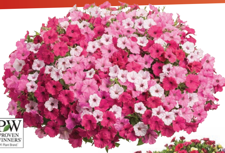
Streamliner™ Above and Beyond