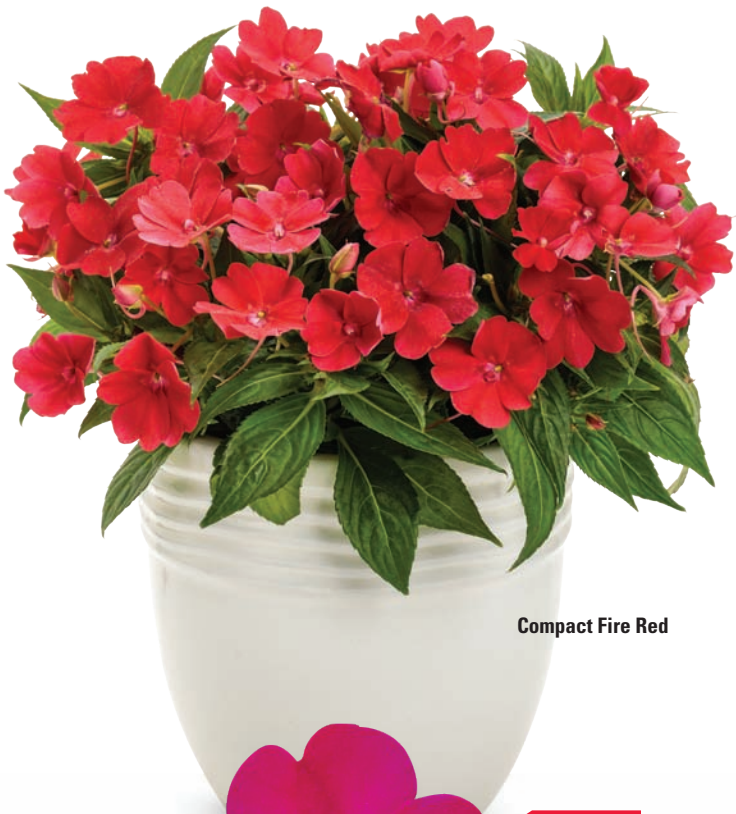
Compact Fire Red