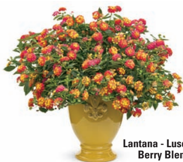
Lantana - Luscious® Berry Blend™