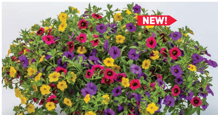
Kwik Kombos™ Cabrio™ Speed Limit™ Mix