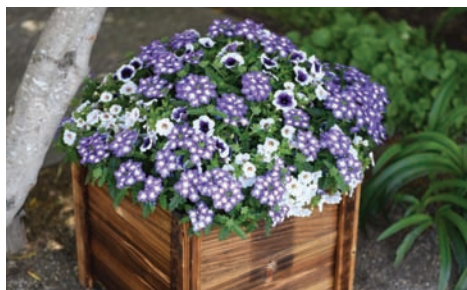
Confetti Garden® Purple Halo