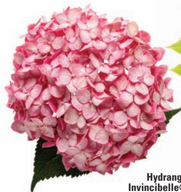
Hydrangea Invincibelle® Ruby