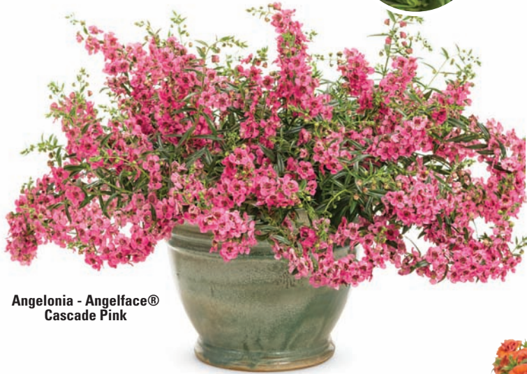
Angelonia - Angelface® Cascade Pink