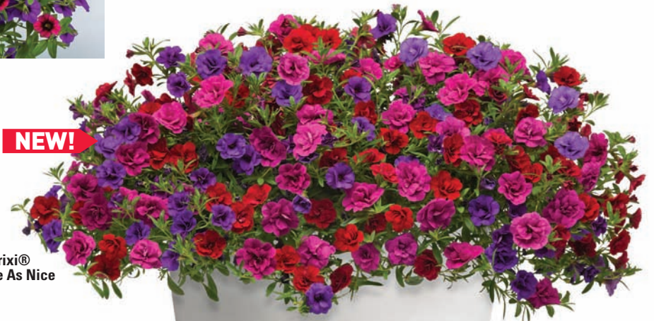
Trixi® Twice As Nice