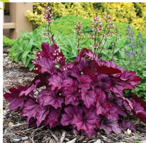
Heuchera - Primo® Wild Rose