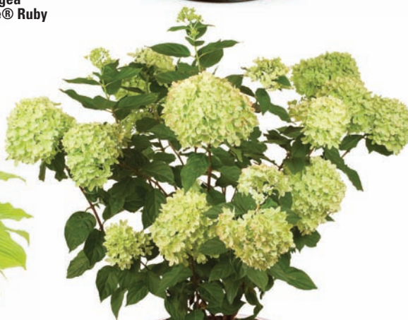
Hydrangea Little Lime®