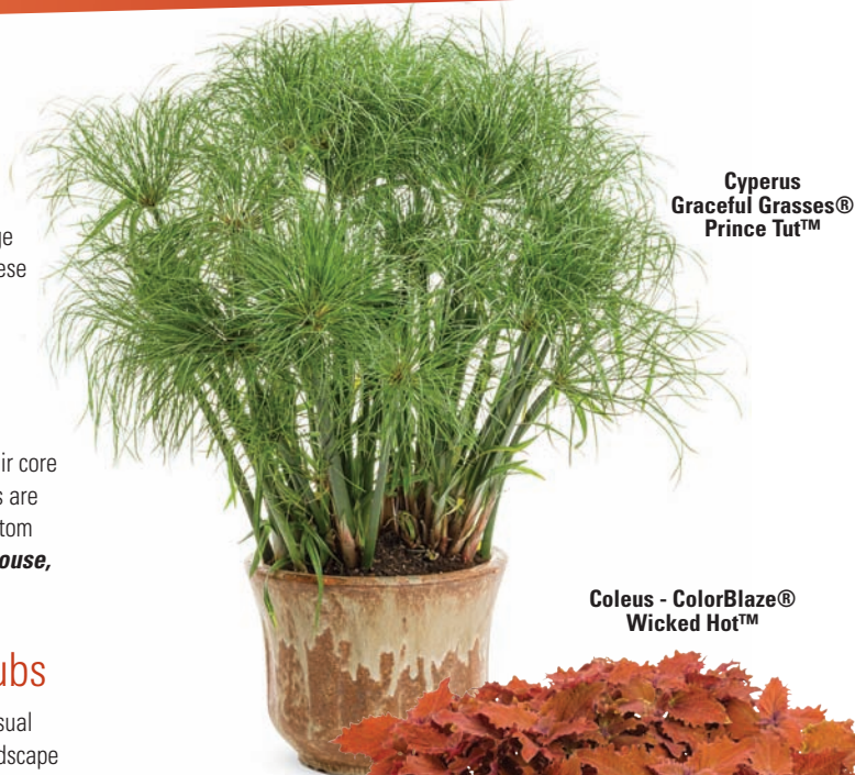
Cyperus Graceful Grasses® Prince Tut™

Shrubs play a vital role in landscaping. These woody perennials provide structure, visual interest, privacy, and traffic control. Offer them as specimen plants for the home landscape or for corporate and civic beautification. Over 50 varieties in the ColorChoice® group provide several options for your region. Grown by Four Star Greenhouse and Pleasant View Gardens