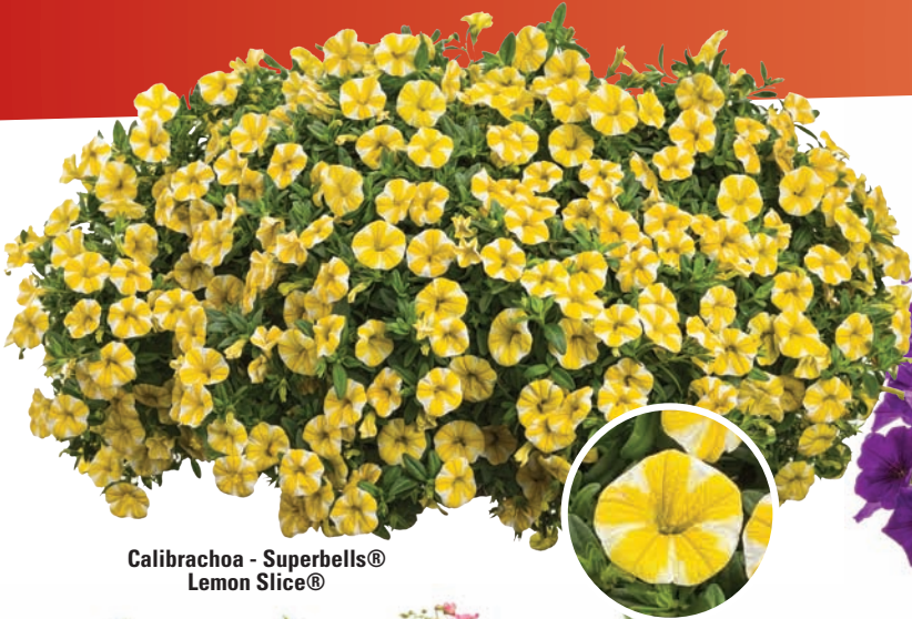
Calibrachoa - Superbells® Lemon Slice®