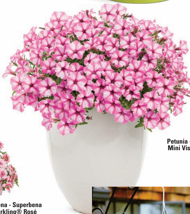
Petunia - Supertunia® Mini Vista™ Pink Star

Many Harris Seeds top selling liner varieties are Proven Winners, a solid testimony of its brand recognition and demand by both growers and consumers. The following pages offer you a glimpse of the Proven Winners product line.