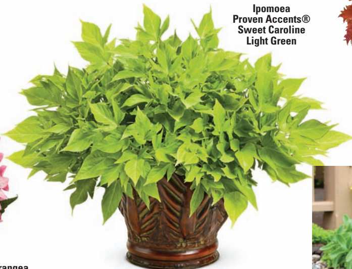
Ipomoea Proven Accents® Sweet Caroline Light Green