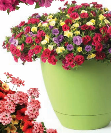
Trixi® Double Date