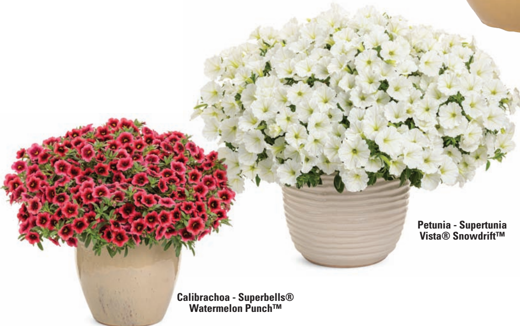
Calibrachoa - Superbells® Watermelon Punch™

Annuals are the flower power behind every gorgeous garden, hanging basket, and patio pot. They are showy, easy-to-grow favorites of both new and experienced gardeners. When you sell Proven Winners annuals, you can count on your customers enjoying big, beautiful blooms all season long with minimal care. Grown by Four Star Greenhouse and Pleasant View Gardens