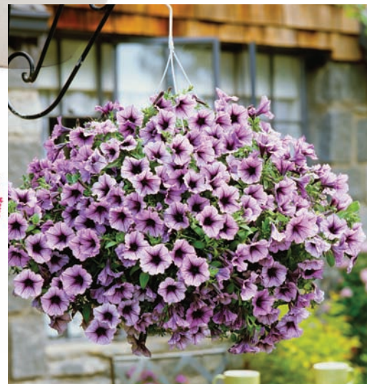
Petunia - Supertunia® Bordeaux™