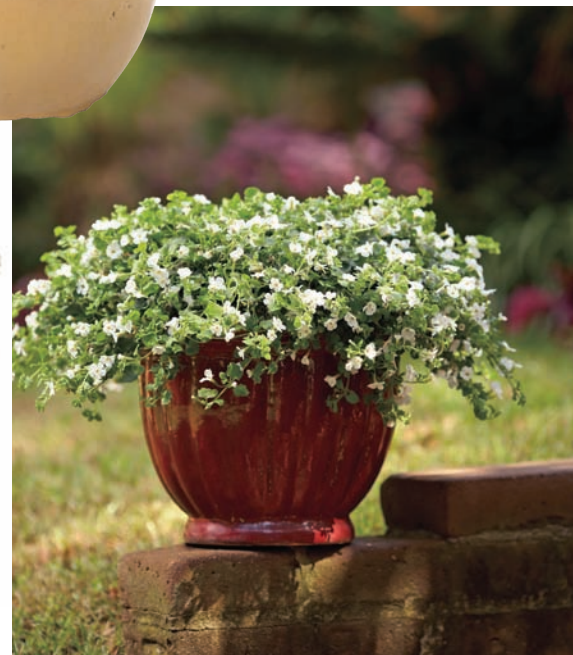
Bacopa - Snowstorm® Giant Snowflake®