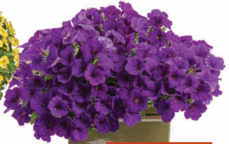
Petunia - Supertunia® Royal Velvet®