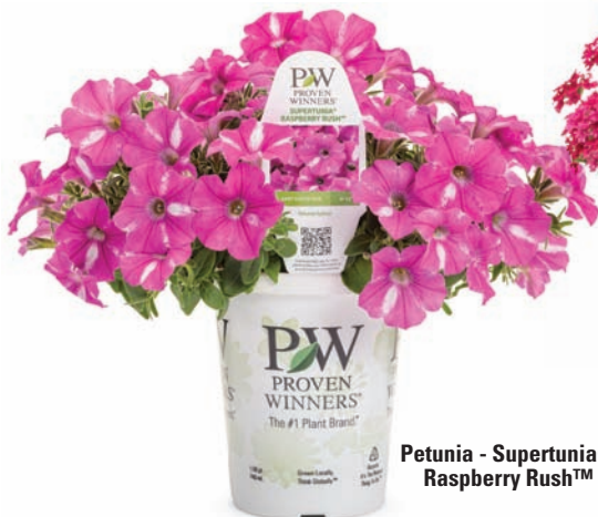
Petunia - Supertunia® Raspberry Rush™