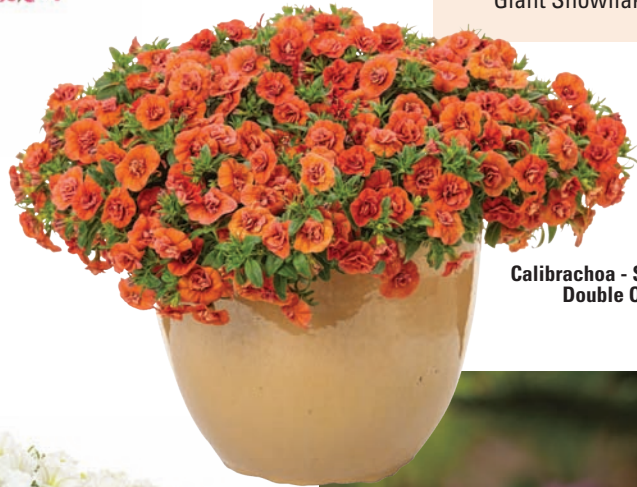
Calibrachoa - Superbells® Double Orange