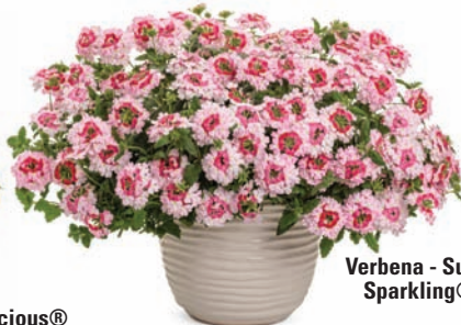
Verbena - Superbena Sparkling® Rosé