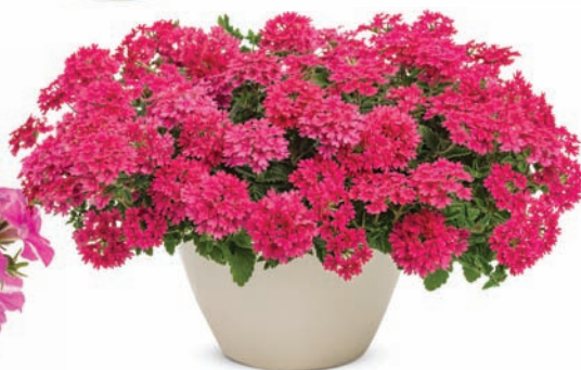
Verbena - Superbena® Raspberry