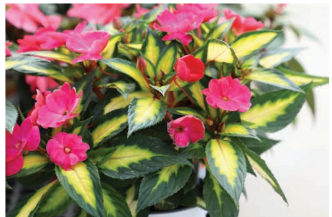
Compact Tropical Rose