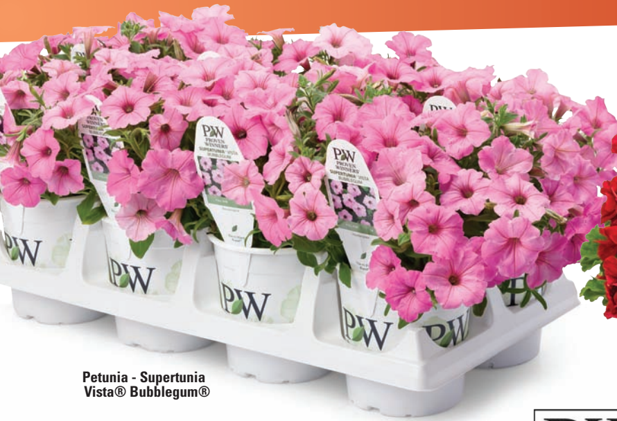
Petunia - Supertunia Vista® Bubblegum®