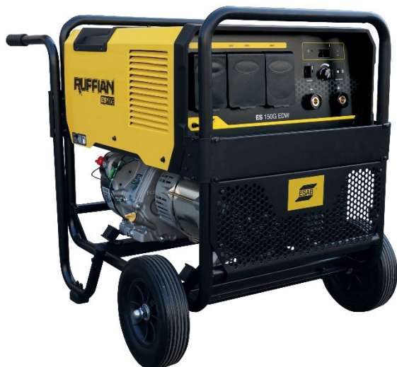
Ruffian ES 150G EDW