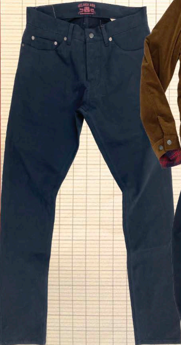
_1026-TWILL "Morrison" 5 Pocket 98% Cotton/2% Stretch - Midnight

Garment washed + Brushed stretch twill + Signature blue leather patch + Signature stitching + Inside plaid pocketing