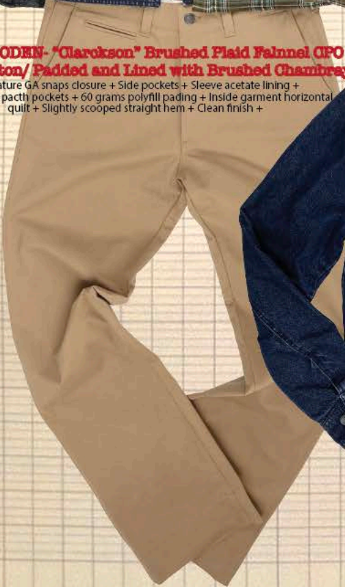
_4284-LODMN- "Clarkson" Brushed Plaid Flannel CPO 100% Cotton/ Padded and Lined with Brushed Chambray +Signature GA snaps closure + Side pockets + Sleeve acetate lining + + large chest patch pockets + 60 grams polyfill padding + Inside garment horizontal quilt + Slightly scooped straight hem + Clean finish +

CPO jacket - another great invention that comes to us from US Navy and North East of US. The North East is a rugged land awashed by frequent Nor'easters. The cold there is snappy and it calls for a jacket that can snap back and forth and take a lot of abuse. Clarkson Jacket is made of finest cotton and lined with soft and warm cotton flannel. Two roomy side pockets, chest pockets for other stuff... We can guarantee that this jacket earns more character every year it does its job!