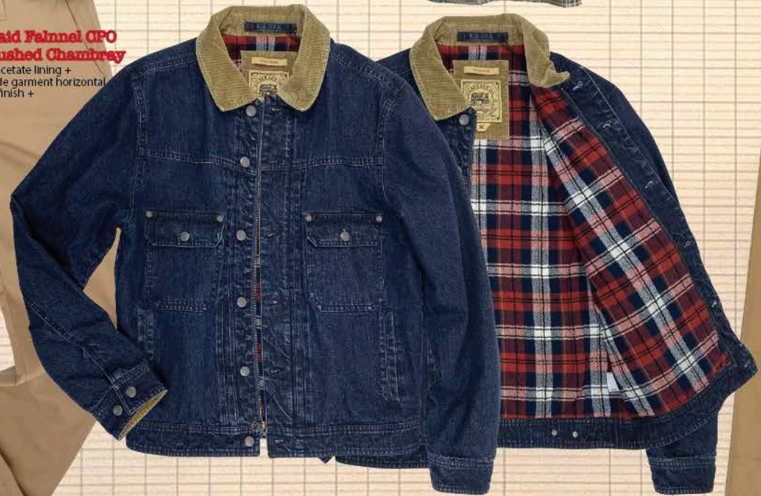
_4160-DNM "Winslow" Brushed Plaid Lined Jkt 100% Cotton -12.25 oz Indigo Denim- Dark Rinse + 100% cotton brushed flannel lining + Clean finished inside seams + +Shank signature buttons +Side entry pockets + Ample chest pockets + Adjustable cuffs + 14 Wale corduroy collar and under cuffs +