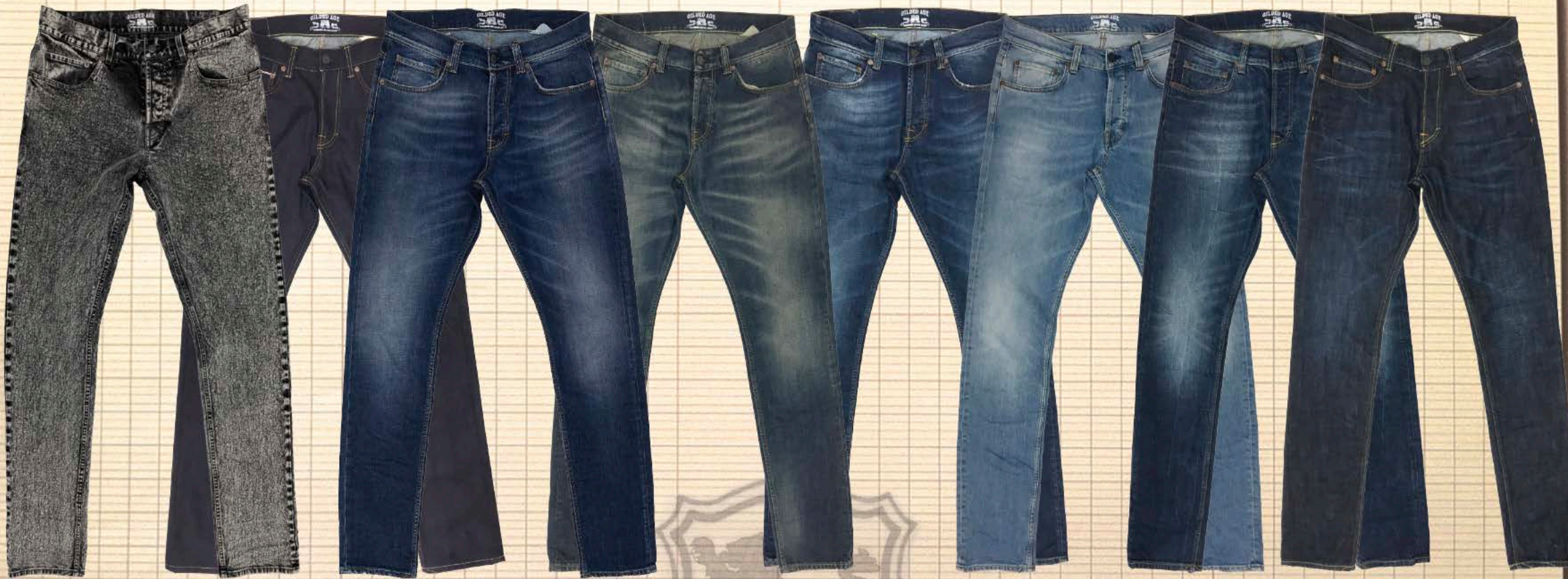
_1025-CATCH- "Morrison" 100% Cotton Red Selvage Deep Indigo Raw