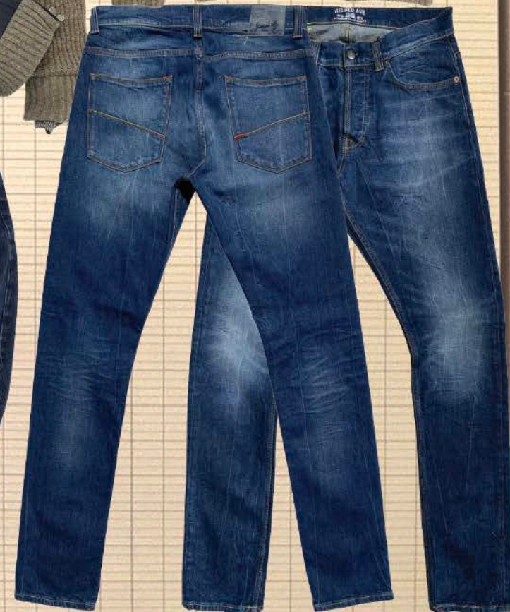
_1025-SUXC - "Morrison" Jean- Katama Blue Wash 98/2 Cotton Stretch 11.3 oz Candiani Denim Made in Italy + 11.5 oz Stretch Denim + Signature blue leather patch + +Signature stitching + Katama blue wash