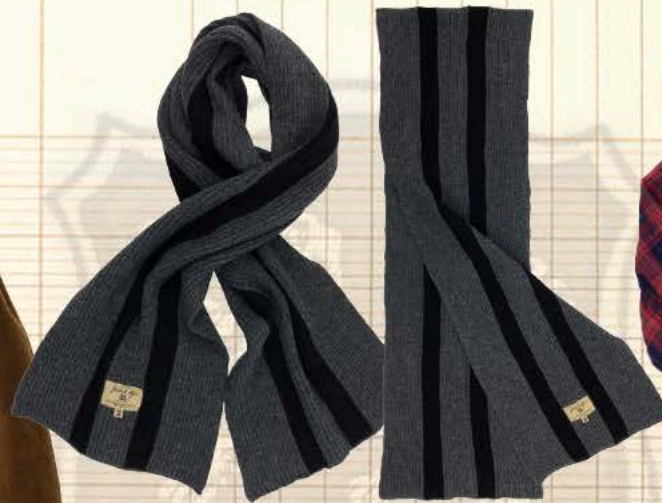
_7592- "Alumni" Cardigan Stitch 5GG Scarf 90% Soft Wool/10% Cashmere 80"x12"

Soft 5GG cardigan stitch + 80" x 12" length scarf + + Double center black stripe+ Dark Gray Heather