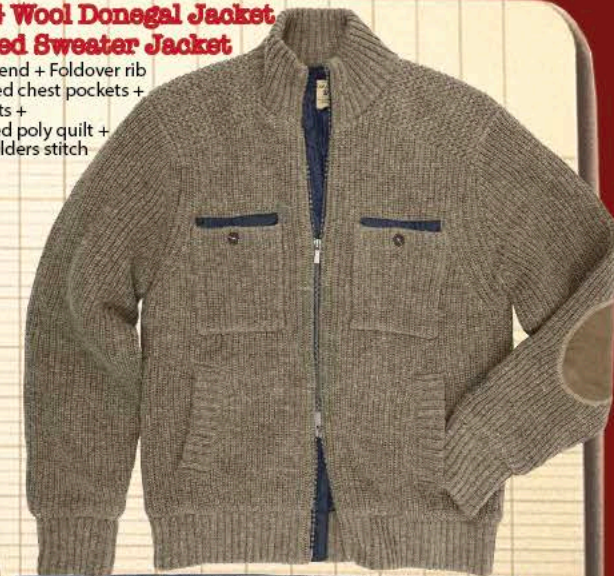
6201-"Charles" 5GG Wool Donegal Jacket Fully Lined/Padded Sweater Jacket +5GG Donegal yarn wool blend + Foldover rib cuffs, collar, hem + Reinforced chest pockets + + Side pockets + +Fully padded and lined poly quilt + + S&Z twist top shoulders stitch