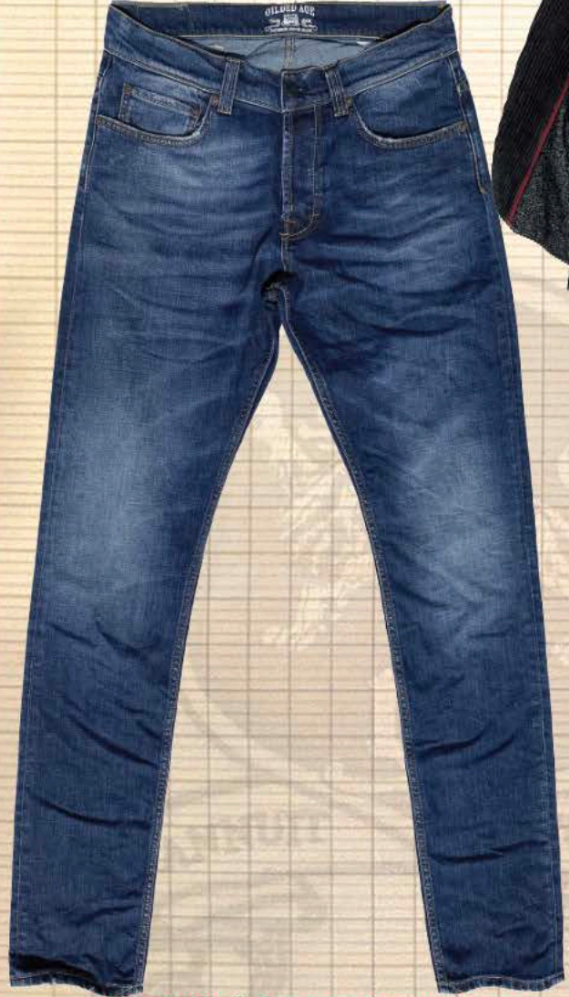
_1025-KHOL "Morrison" Blue Jean 98% Cotton / 2% Stretch - Medium Clean Wash

We think a sportcoat should be something you can live - and move - in, unlike the straitjacket mold from which many on the market today have been cut. So we made ours as nonrestrictive as a sweater, with full cut sleeves, functioning cuffs, and back slit hem for movement. To enhance supple feel, there is a rayon split back lining with a brushed plaid flannel that drapes beautifully. The fabric is plush, extra thick 6 wale corduroy. At last, a sportcoat that truly lives up to its name!