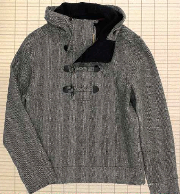
_5447-HERBON- "William" Heavy Wool Hood Pullover 80% Wool, 20% Nylon- Gray Herringbone Double-face +695 grams heavy wool double-face + Real horn toggle buttons + Real leather reinforcement patches + Contrast color inside + Self fabric drawcord hood +