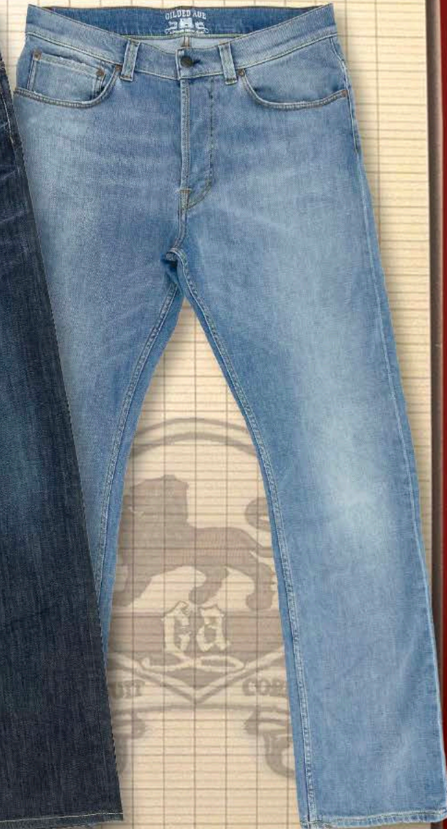
_1003-O'NUTT-"Houston" Wide Leg Jean 98% Cotton/2% Stretch Italian Denim- Light Blue Wash

Made in Italy + 11.8 oz stretch twill + 11" rise + 4 CF Fly buttons + Signature stitching + Special worked wash for aged patina + Signature Gilded Age Blue leather patch + Signature hardware