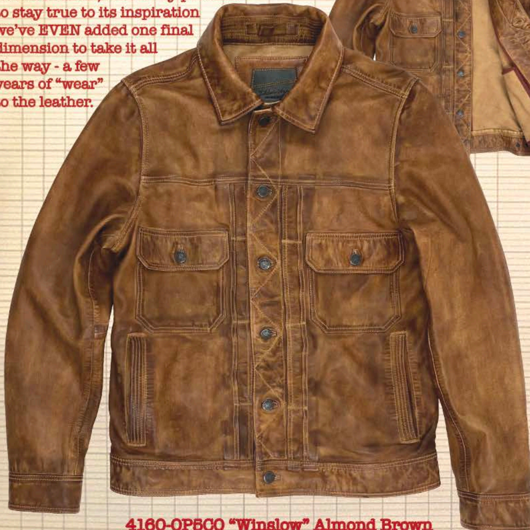
_4160-OPSCO "Winslow" Almond Brown 2 Tone Leather Unlined Jacket

Originally styled in the late 1930's, worn by folks on farm stands and factory floors. Crafted from first-quality matched sheep-hide to Gilded Age specks and 2021 design. Every detail from the 1930's ancestors is here: front pleats, lower chest pockets, shank buttons, side entry pockets. To stay true to its inspiration we've EVEN added one final dimension to take it all the way - a few years of "wear" to the leather.