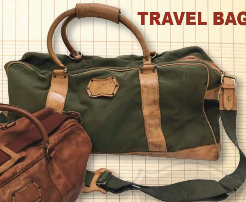
_9010- "Weekender" 18 oz Cotton Canvas / Leather Duffel Bag