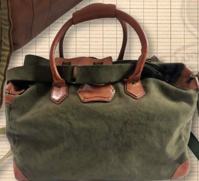
GA-9020 -Canvas Leather GlobeTrotter Travel Bag