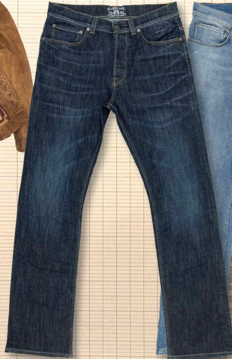
_1003-TEDBLUE-"Houston" Wide Leg Jean 98% Cotton/2% Stretch Italian Denim- Dark Worked

Made in Italy + 11.8 oz stretch twill + 11" rise + 4 CF Fly buttons + Signature stitching + Special worked wash for aged patina + Signature Gilded Age Blue leather patch + Signature hardware