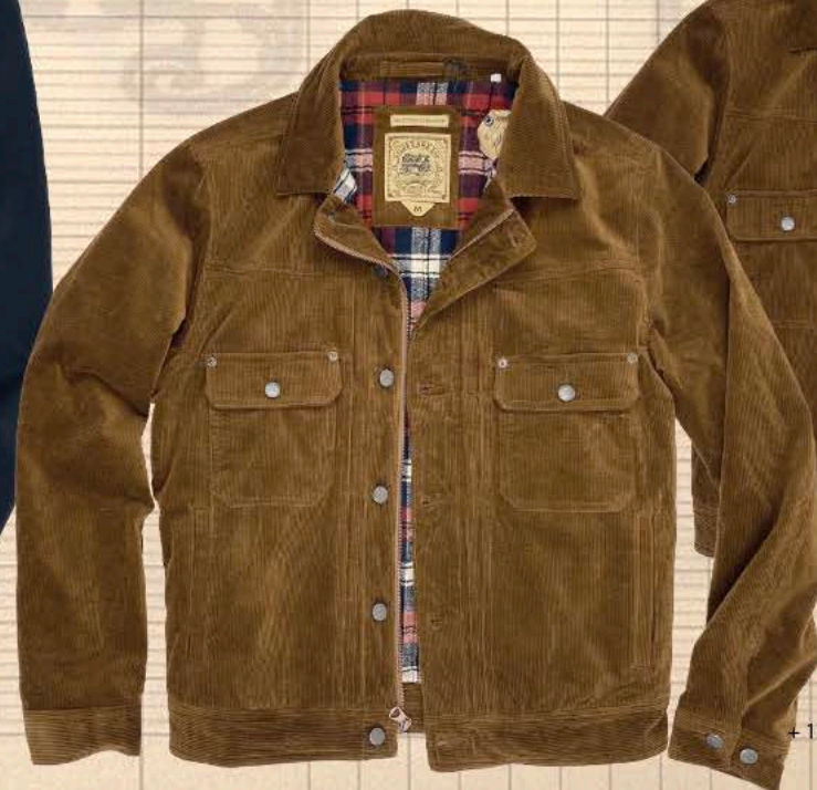
_4160-CORD "Winslow" 11 Wale Cord 198% Cotton/ 2% Stretch Corduroy

+ Real, Thick, Mother of Pearls Buttons + Well thought out contrast trims + Left chest pocket + Clean finish tape