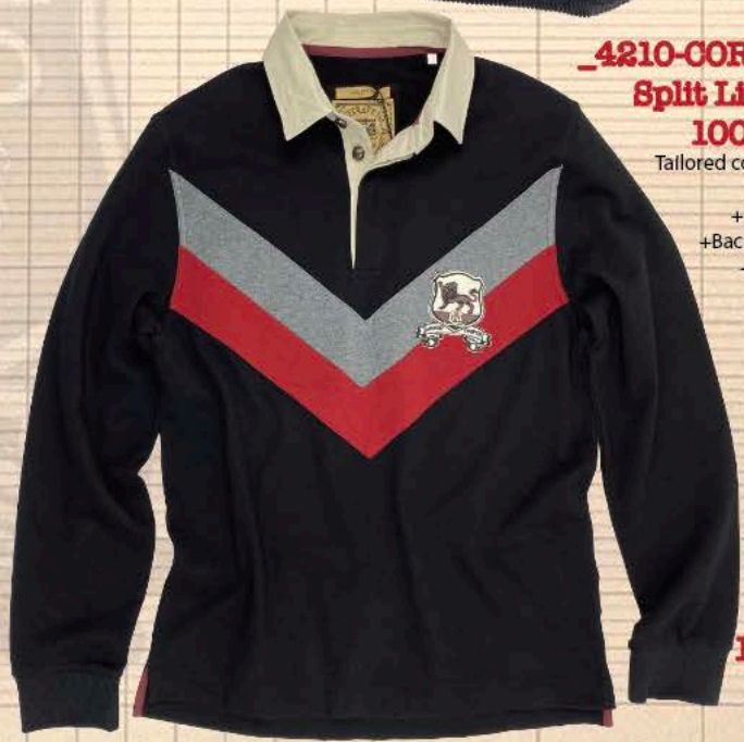
_5462-C&S "Victory" V-Shape Cut & Sew Striped Rugby - Black 100% Cotton - 250 grams Terry Cloth