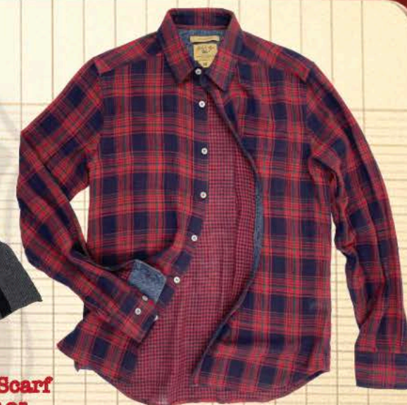
_3001B-86 "Franklin" DF Shirt 100% Cotton Double face-Red Navy DF Plaid

Soft 5GG cardigan stitch + 80" x 12" length scarf + + Double center black stripe+ Dark Gray Heather