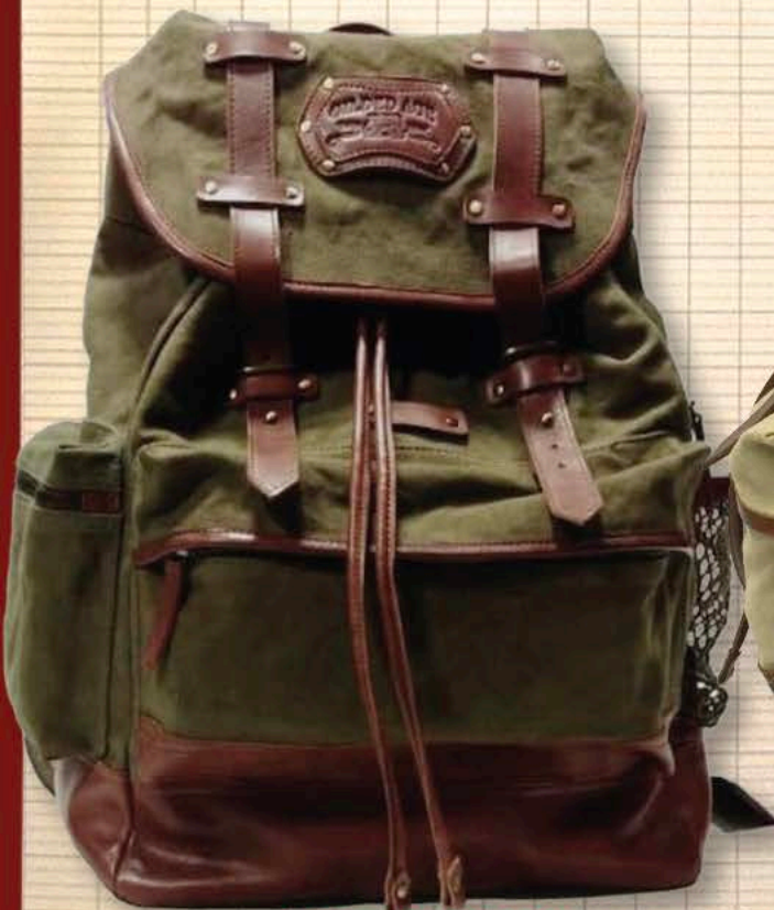
Green/ Single Malt