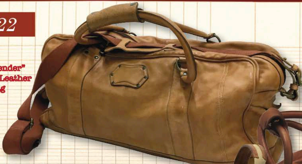
_9010- "Weekender" Waxed Tumbled Leather Duffel Bag