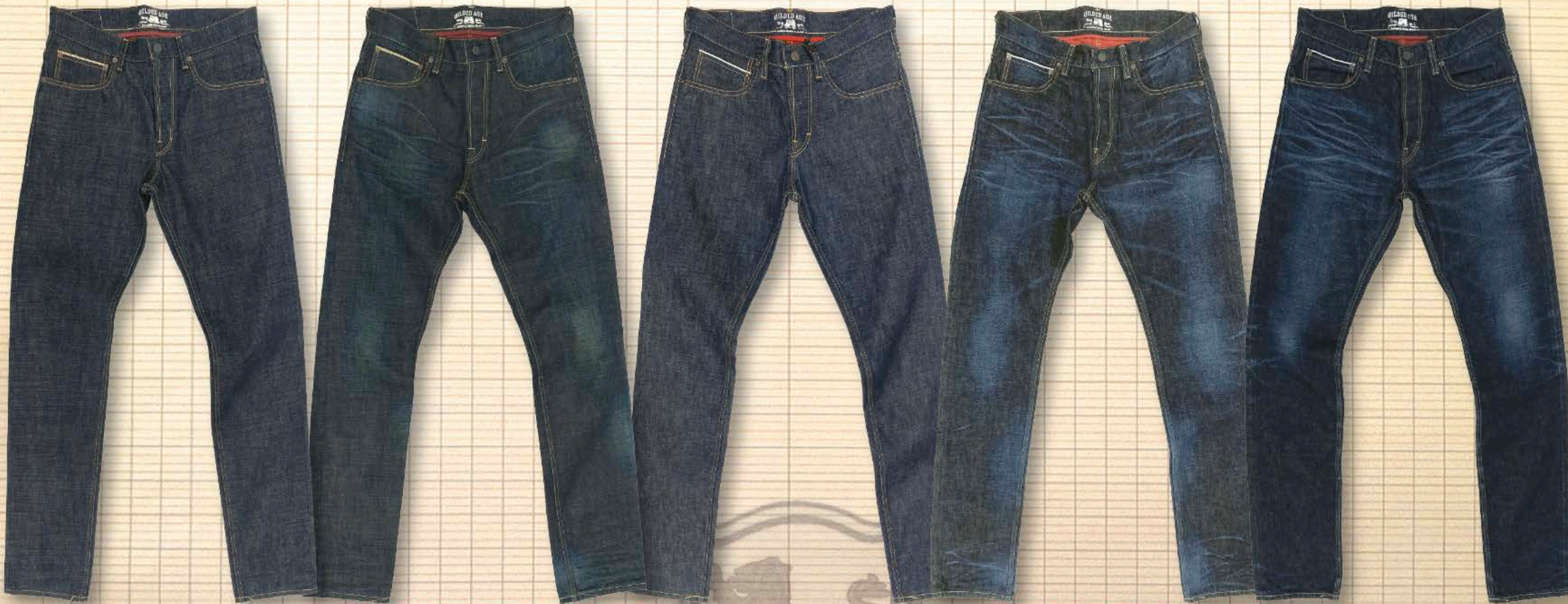
_1011-NM1047-TOYO- "Baxten" Arist Wash Slubby Indigo