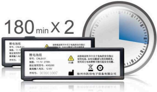
Two large-capacity lithium batteries, about 360 minutes work.