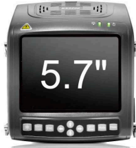
5.7 Inch high resolution colour TFT LCD monitor forming a clear image under the sunshine for special treatment.