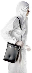
Backpack integration design, convenient for veterinary and farm use