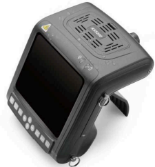
The main unit with the splash-proof, dust-proof function, easy to clean.