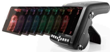
8 kinds of internal Pseudo color display