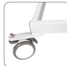
LynX Base configured for Hoist Access