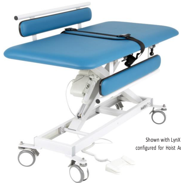
Shown with LynX Base configured for Hoist Access