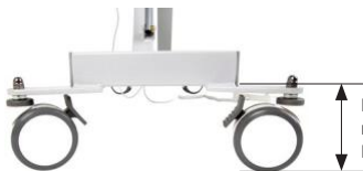
LynX Base configured for Hoist Access

Hoist Access Clearance of 140mm adds 110mm to minimum and maximum heights for this LynX Base configuration, as shown in the Range Of Movement (ROM) diagram for product code 53232P-CT