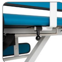
Quick Release Latch for Side Rails