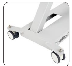
SX Base Option