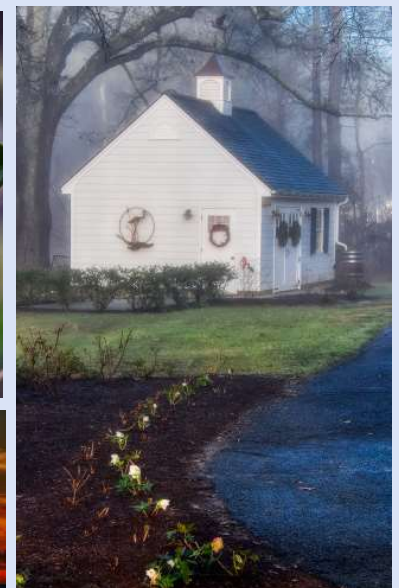
Above: Hellebores Top left: January Camellia Bottom left: After the storm