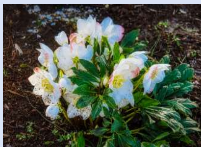
Hellebore on New Year's morning

Something extraordinary! After a quick freeze in December, temperatures hit the sixties for New Year's Day, and all of our hellebores popped. (homeopathic: Helleborus Niger). Our garden was a sea of white flowers. Nearby our camellia bloomed in red. The good news was that this was an unexpected and extraordinary sight. The bad news is that it has snowed again, and the spring flush will be much more restrained. Since the second snow, all that garden activity is covered in a blanket of white.