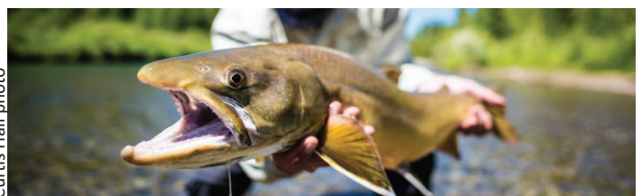
Wigwam River bull trout