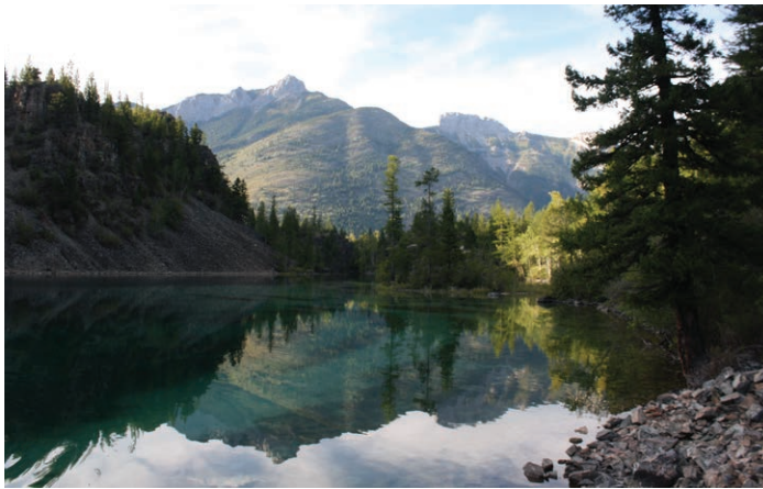
Silver Springs Lakes (First Lake)

body of water. The rainbow trout in the first lake grow to good sizes, with the average being 30-40 cm in length. Fishing is very productive off of the scree slopes along the east shore, and at the shallows at the south end of the lake. The shallows can be especially tantalizing during low-light periods, when many of the larger fish move there to feed. A well-worn trail continues past the end of the first lake to the second and third Silver Spring Lakes. The second lake, half a kilometre beyond the first, is a shallow pond that does not hold any trout. Fifteen minutes of hiking past the second lake brings one to the third lake, a dark body of water with high cliffs on several sides. Forest cover and extended shallows make shore fishing difficult. One of the better options is to fish off of the 5m-high rock bluffs, where you can at least cast to fish-holding waters. The difficulty arises when you hook a big one and have to figure out how to land it. There are other ponds beyond the third lake, but none has been stocked.