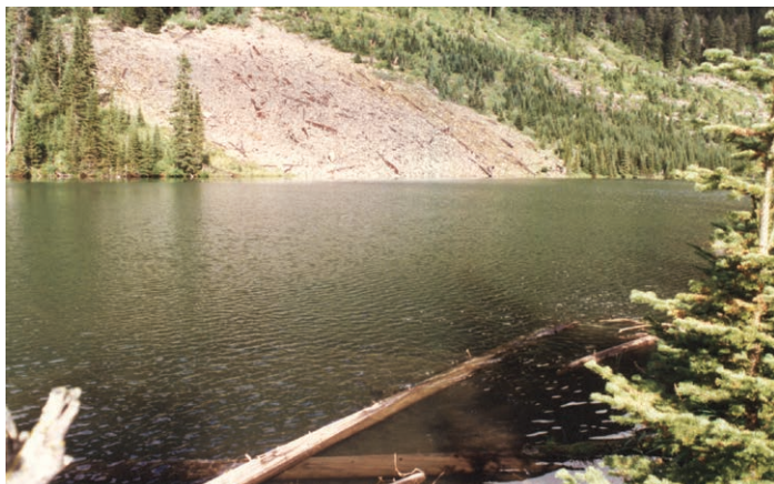
Harvey Pass pond

This small lake, which drains westward into Lodgepole Creek, is located alongside the logging just west of Harvey Pass (the pass between Lodgepole and Harvey Creeks). Heavy brush surrounds the lake, and just finding an opening to make a cast is very difficult. The lake holds small cutthroat trout, few larger than 20 cm in length.