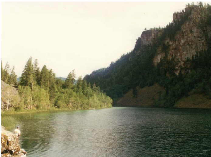
Silver Springs Lakes (Third Lake)