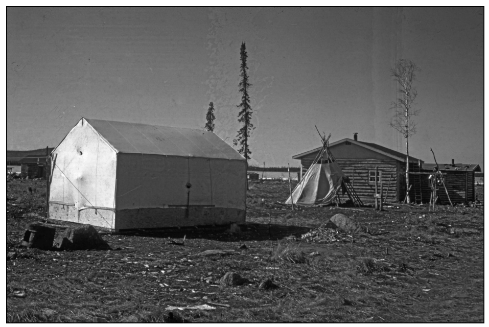
Log home, tipi smoke tent and my prospector's tent