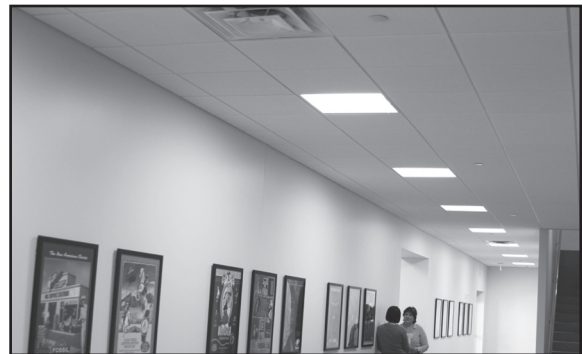
TMS diffusers installed in the ceiling of an office building