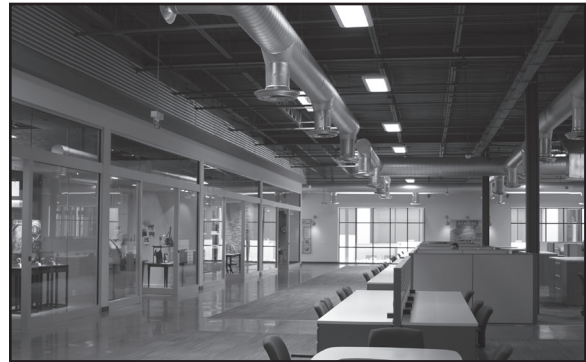
TMR diffusers installed in an open ceiling office environment