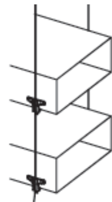
HVAC or mechanical services (double tier)