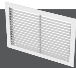
350 (ZRL / ZRS)