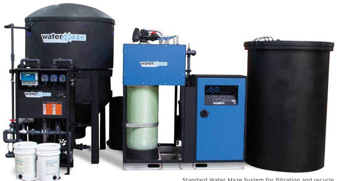
Standard Water Maze System for filtration and recycle

NOTE: Each media housing includes 50 lbs of Gravel, 75 lbs of Garnet, and 250 lbs of Zeolite Media