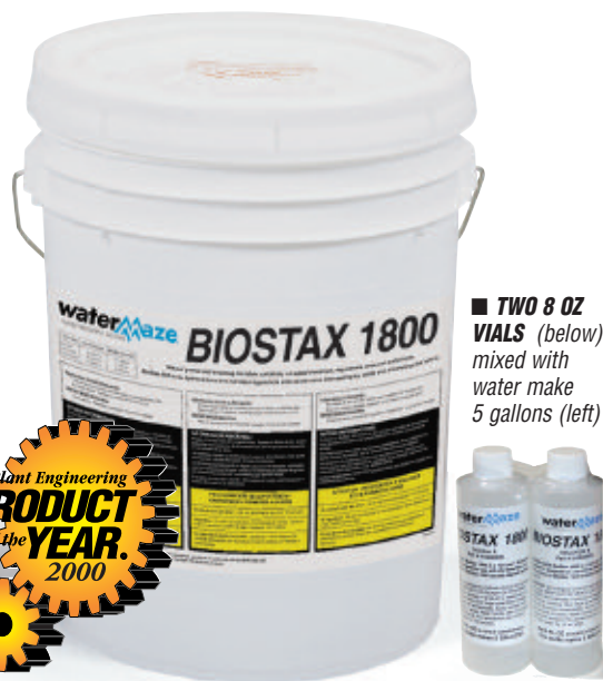
■ TWO 8 OZ VIALS (below) mixed with water make 5 gallons (left)

Important: BioStax 1800 must be kept refrigerated prior to use.