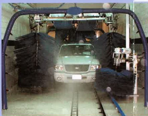
Optional Low Side Washer shown.

The insta-KLEEN's™ Equipment Control Center is literally a "backroom in a box," housing and integrating all of the support and control equipment, plumbing and valves, chemical metering and utility distribution into an orderly and user-friendly platform.