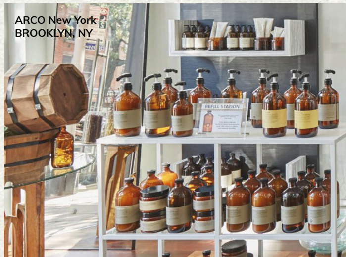
ARCO New York BROOKLYN, NY