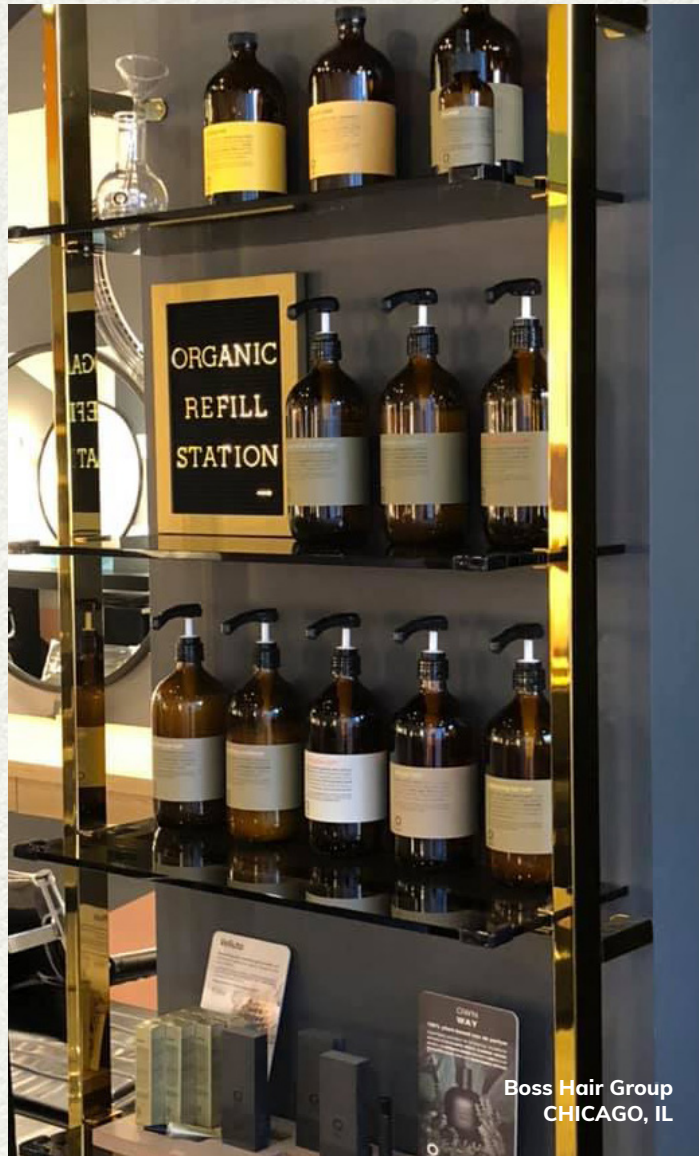
Boss Hair Group CHICAGO, IL