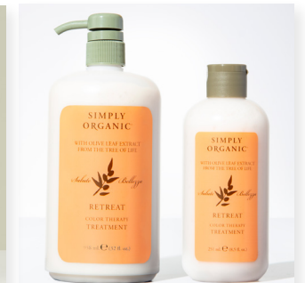
Retreat Color Therapy Treatment

Balancing, Volume & Tonic, Energizing, Sensitive, Purifying Dandruff