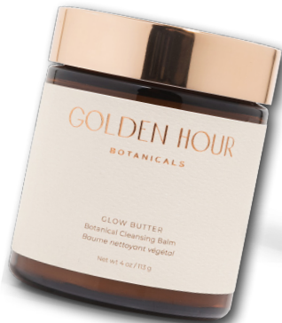
GLOW BUTTER Botanical Cleansing Balm