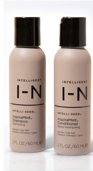
Inspiramint Shampoo & Conditioner Travel Set