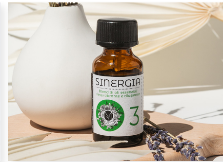
SINERGIA Essential Oil Collection