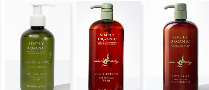
Re-Juva Base Hair & Scalp Wash