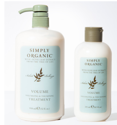
Volumizing & Thickening Treatment