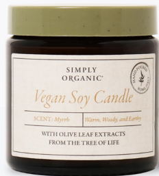
Vegan Soy Candle