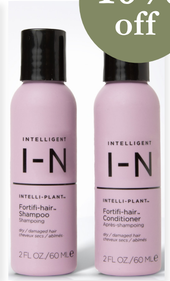
Fortifi-hair Shampoo & Conditioner Travel Set