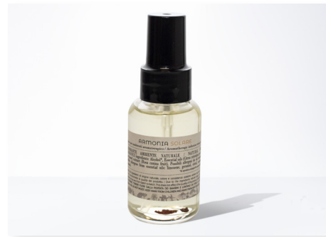
ARMONIA SOLARE Aromatherapeutic Spray