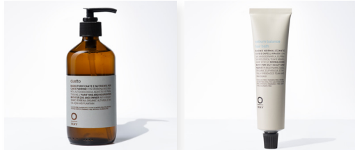
Sebum Balance Hair Bath Duetto Dog Shampoo