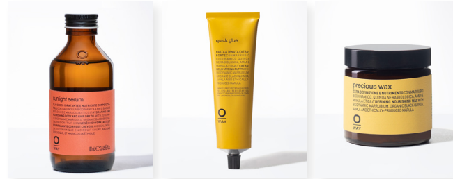
Sunway Sunlight Quick Glue Precious Wax