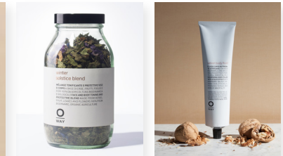
Winter Solstice Velvet Body Fluid

Prodigious Balm Give the gift of supple skin this year with Oway Prodigious Balm, an all-in-one, ultra-rich treatment balm that soothes, moisturizes and regenerates the skin. With nourishing Organic Safflower Seed and Ethical Date Oil, Prodigious Balm makes a great gift for loved ones.