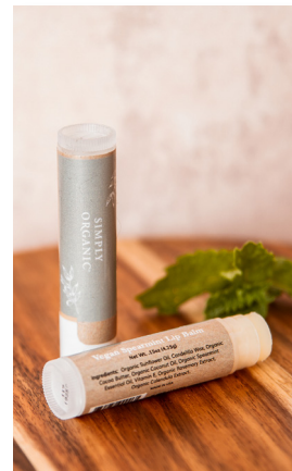
Vegan Spearmint Lip Balm