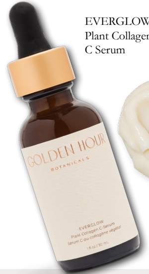
EVERGLOW Plant Collagen C Serum