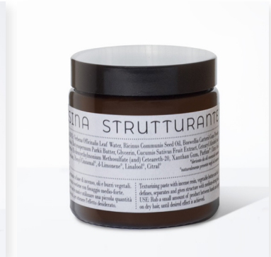
RESINA STRUTTURANTE Strong Texturising Paste