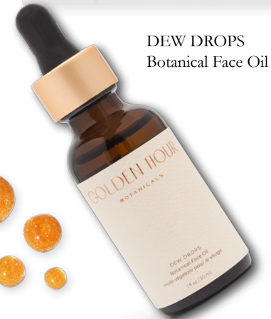
DEW DROPS Botanical Face Oil