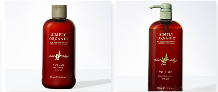
Volume Hair Rinse

This daily use duo is formulated with gentle surfactants, olive oil, and phyto-organic extracts that give the hair softness, shine, and light hydration.