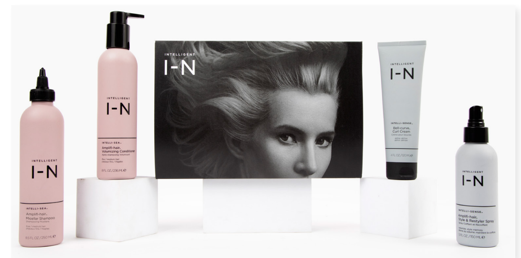
Amplifi-hair Gift Set

Limited edition gift set of our 4 best, full-sized volume and body amplifiers! No matter your hair type or texture, these products will lift, shape and form your best body of hair yet.