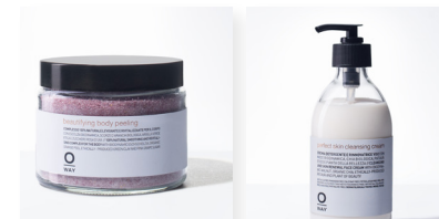
Beautifying Body Peeling Perfect Skin Cleansing Cream