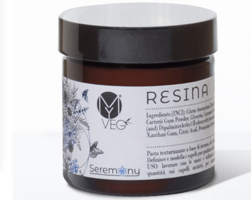
RESINA MODELLANTE Soft Texturising Paste