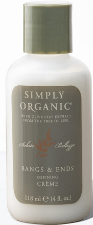
Bangs & Ends Crème