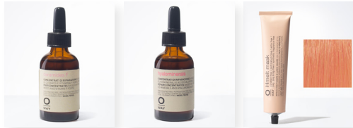
Ceramides F Hyalominerals Hmelt Mask Sunny Orange