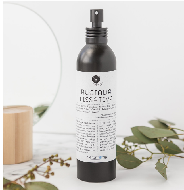
RUGIADA FISSATIVA Hair Spray

This finishing mist ensures long-lasting hold, is non-sticky, and does not leave any residue. It provides a light to medium hold and support while leaving hair soft to the touch, even in extremely humid conditions.