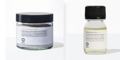
Calming Face Fabulous Body Oil