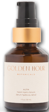
AURA Neroli Hydro Serum