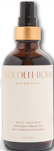
MAGIC HOUR MIST Adaptogenic Beauty Elixir