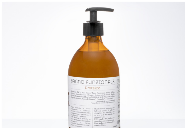
BAGNO FUNZIONALE PROTEICO Nourishing Hair Bath