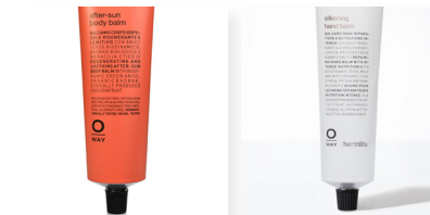
Aftersun Body Silkening Hand