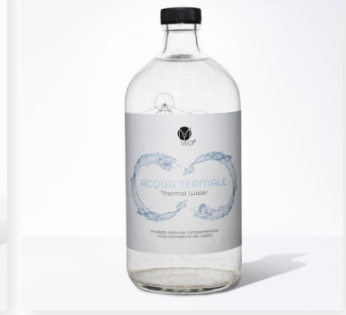
ACQUA TERMALE Thermal Water