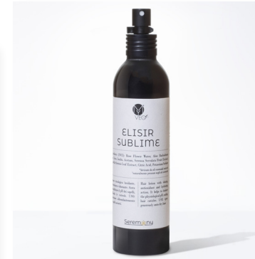
ELISIR SUBLIME Sublime Hydrating Elixir

This finishing mist ensures long-lasting hold, is non-sticky, and does not leave any residue. It provides a light to medium hold and support while leaving hair soft to the touch, even in extremely humid conditions.