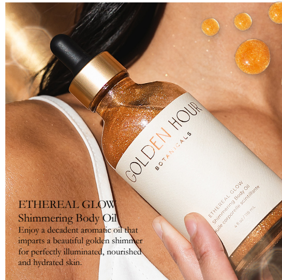
ETHEREAL GLOW Shimmering Body Oil Enjoy a decadent aromatic oil that imparts a beautiful golden shimmer for perfectly illuminated, nourished and hydrated skin.