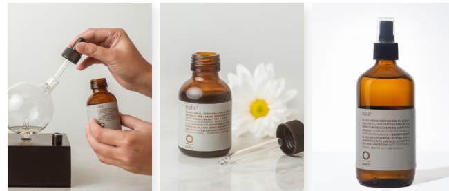
Segno Essential Oil Diffuser NOTA 2 Essential Oil Blend NOTA 3 Essential Oil Blend