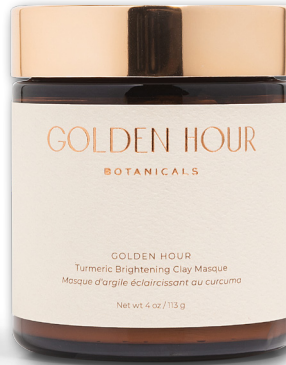
GOLDEN HOUR Turmeric Brightening Clay