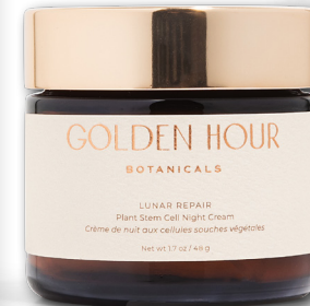
LUNAR REPAIR Plant Stem Cell Night Cream