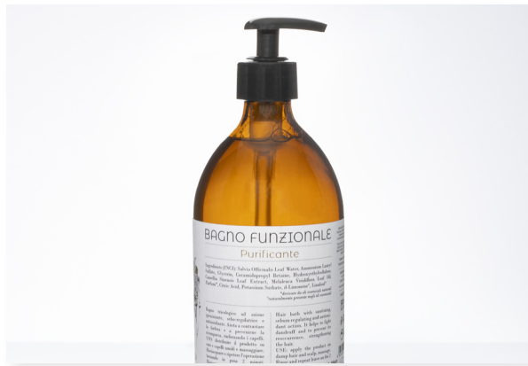
BAGNO FUNZIONALE PURIFICANTE Detoxifying Hair Bath