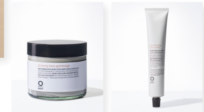
Glowing Face Gommage Age Defying Face Mask