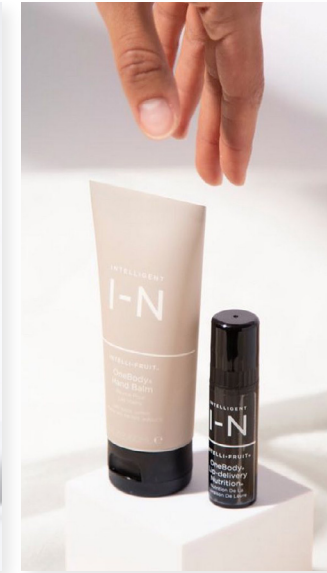
OneBody Hand Balm & Lip Delivery Travel Set