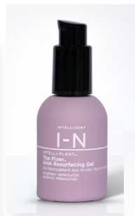
The Fixer AHA Resurfacing Gel

Liquid Green Body Oil This deep green body oil relights the skin's natural brightness and leads to instant obsession. Enjoy smooth, soothed, and renewed skin with plant-based ingredients that infuse hydration and support elasticity.