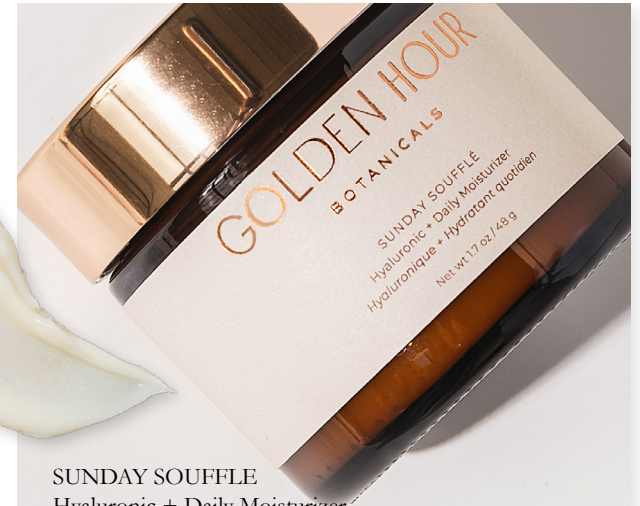
SUNDAY SOUFFLE Hyaluronic + Daily Moisturizer This lightweight moisturizing cream delivers daily nourishment and improves overall skin health and resilience with a powerhouse of collagen-promoting plant peptides.