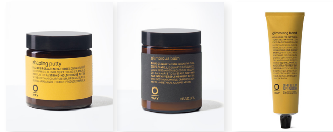
Shaping Putty Head Spa Glamorous Balm Glimmering Bond