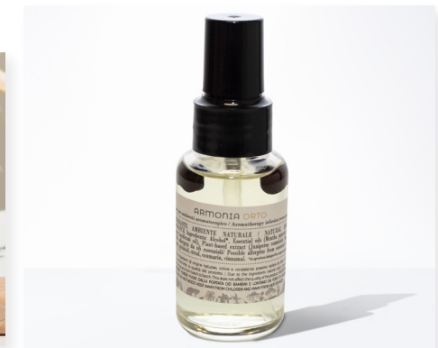
ARMONIA ORTO Aromatherapeutic Spray