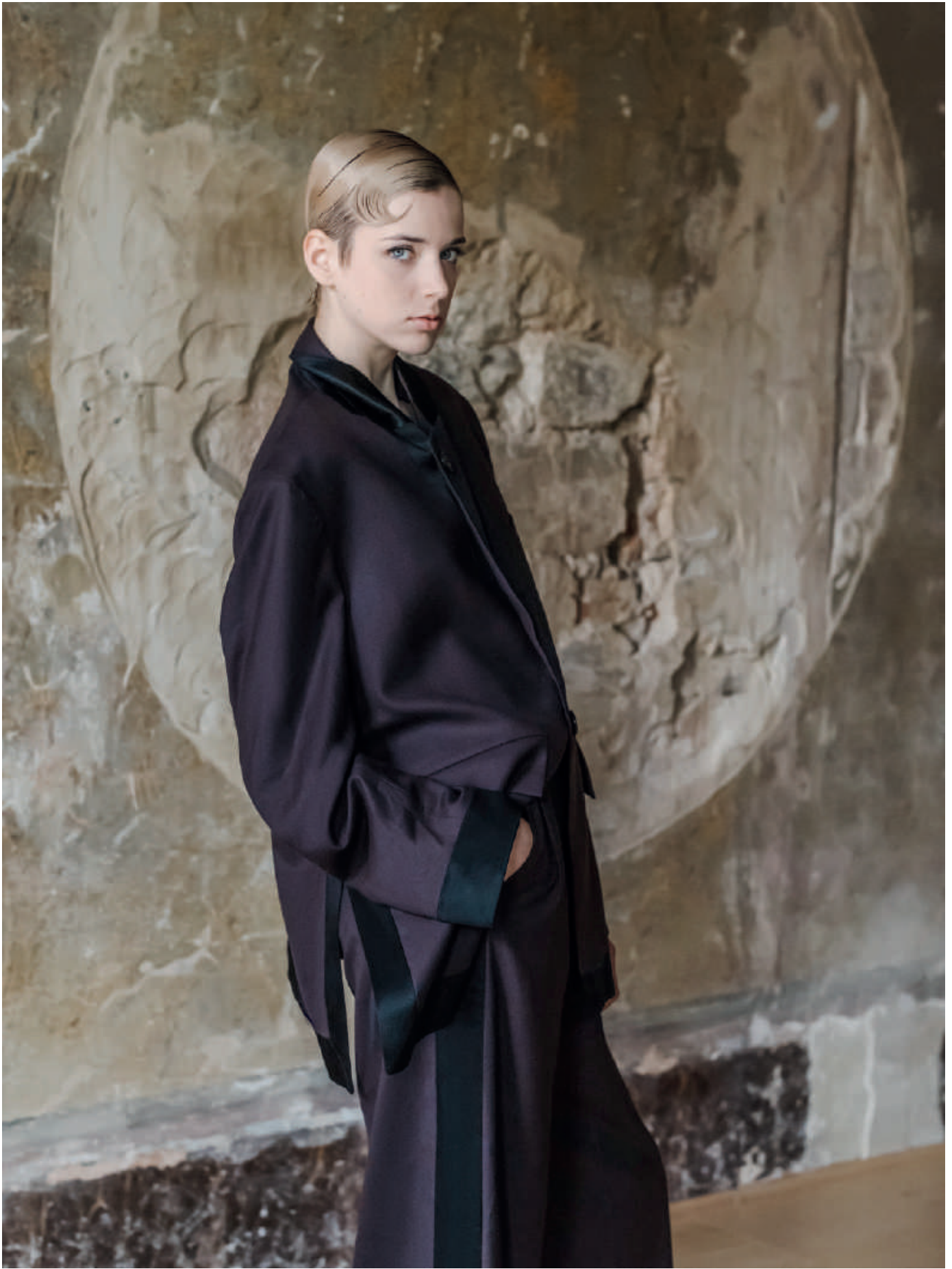
PRODUCTS USED: flux potion, glimmering bond, sculpting mist