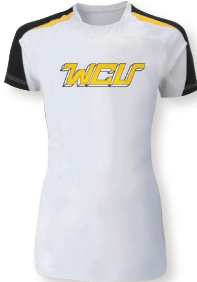
Custom Sub Design