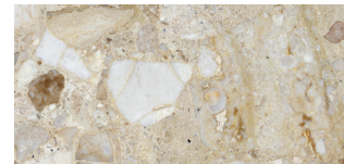
KUNIS BRECCIA STONE