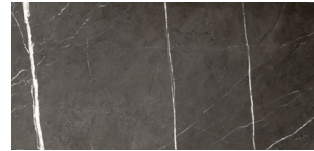
GREY KENDZO MARBLE