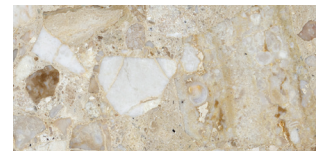
KUNIS BRECCIA STONE