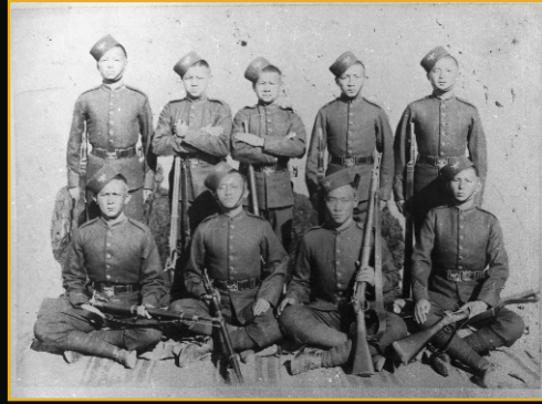
These Gurkha troopers were armed with Snider-converted P'1853 Enfields.