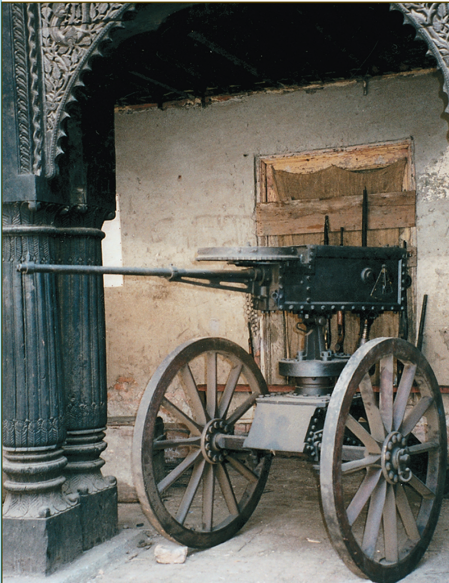
The .577-450 Martini-Henry Bira gun (above), designed and built in Nepal, operates similarly to the American Gardner gun. The artillery (r.) represented everything from siege guns to howitzers and mortars. The brass and iron mortars (middle) were from various countries and periods. Napoleonic period brass cannons (far r.) had been converted to breechloaders.

In 1845, Bhimsen Thapa's nephew became prime minister and set about righting the wrongs that had been done to his uncle, deftly removing all enemies in a subsequent purge. Lagan Silekhana was never reoccupied, and instead turned into a royal arsenal to house British gifts as well as home-fabricated arms and equipment.