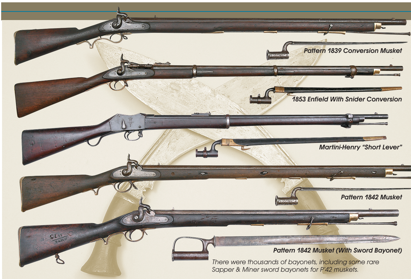
Pattern 1839 Conversion Musket