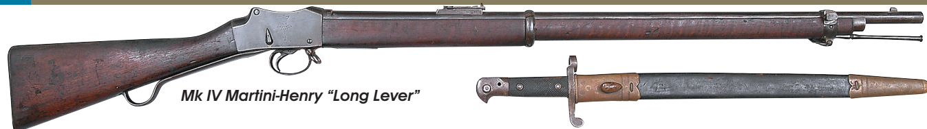
Mk IV Martini-Henry "Long Lever"