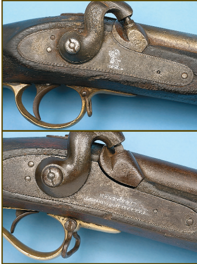
All Pattern 1842s (top) found in Nepal were of the East India Company with spurred triggerguards. Lock markings show the "EIC" insignia. Though not as abundant as the P'42s, the Pattern 1839 conversions (bottom) were represented in some numbers. This particular example has a lock built by Manton of Calcutta—one of the preeminent makers in India.

Nepalese-made-and-designed mechanical machine guns based on the Gardner principle. Chambered in .577-450 Martini-Henry, they are nothing if not imposing. From their huge boxy steel receivers through their gigantic drum magazines and massive field carriages, they are undoubtedly the strangest looking automatic arms ever built—and they're also really neat. There were tons (literally) of other artillery pieces from stubby little mortars to some pretty heavy-duty brass howitzers. I was particularly impressed with some Russian guns that looked similar to those in photos taken during the Crimean War. More than likely they were captured in the Crimea and eventually sent surplus to Nepal. Who knows, they could have been in the batteries that fired upon the Light Brigade! There were a large number of brass Napoleonic-period guns that had been converted to breechloaders, as well as a British nine-pounder muzzleloading field gun of Zulu War vintage that had been altered to breechloading and fitted