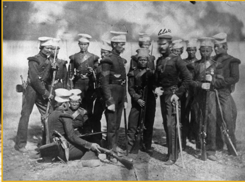
This vintage image shows Gurkhas armed with P'1842 muskets and Kukri knives.