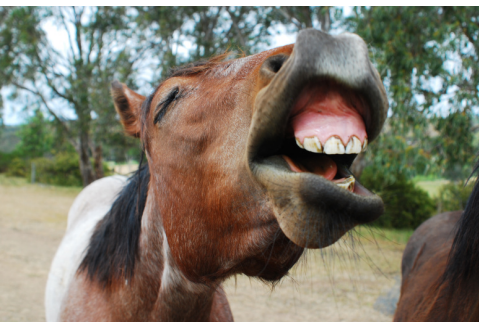
NATURAL WAY TO HAVE YOUR HORSE FEELING & BREATHING BETTER