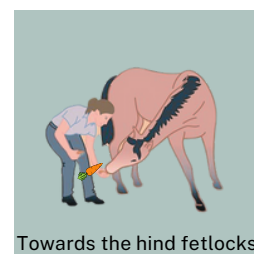
Towards the hind fetlocks