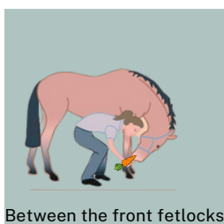
Between the front fetlocks