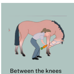
Between the knees