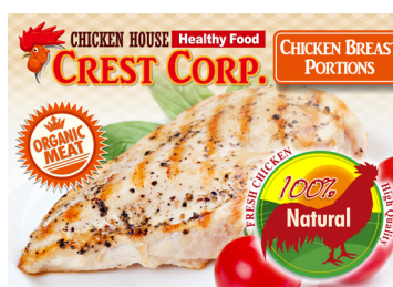
Food and beverage label