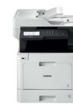
Multi-Function Centre MFC-L8900CDW