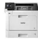
Single Function HL-L8360CDW