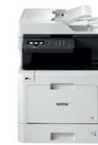
Multi-Function Centre MFC-L8690CDW