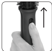
Slide Up to Lock