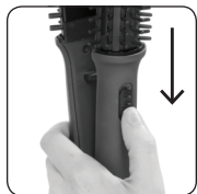
Slide Down to Open

Open the barrel for straightening, close the barrel to use as a heated round brush.