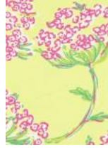
Palm Beach Blooms #100