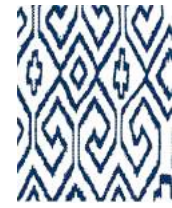
Navy Argyle #350