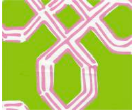
Capri Argyle #340