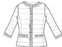
SE17-130 - $79 Gros Grain Jacket