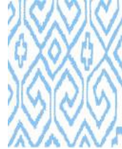
Periwinkle Argyle #360