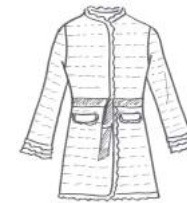
SE17-145 - $86 Ruffle Edge Jacket Can come all solid with no contrast trimming