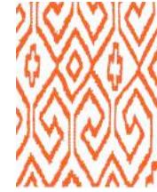
Tangerine Argyle #370