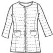
SE17-110 - $82 Gros Grain Zipper Cardigan