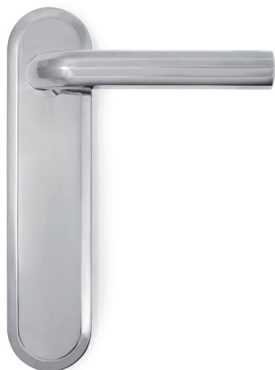
Lever handle on plate Plate : 200 mm x 47 mm (LxW)