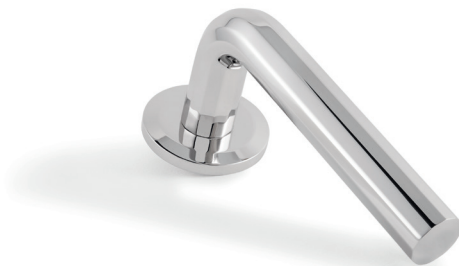
Lever handle on rose 127 mm x 60 mm (LxP)