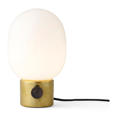
Mirror Polished Brass 1800839