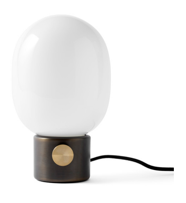
Bronzed Brass 1800859