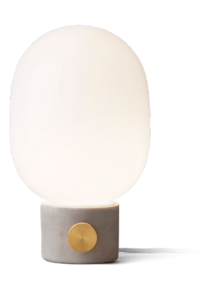
Light Grey/Brass 1800129