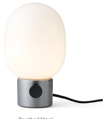
Brushed Steel 1800039