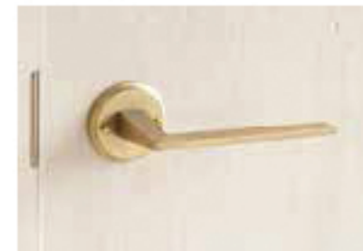
[Lever Handle] Line + [Plate] Circle w134xh19xd56mm Code LH-SM