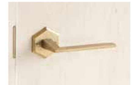
[Lever Handle] Line + [Plate] Hexagon w134xh19xd56mm Code LH-SR