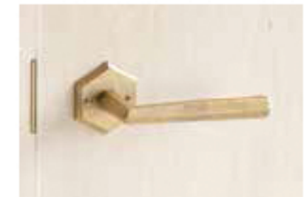
[Lever Handle] Hexagon + [Plate] Hexagon w136xh19xd55.5mm Code LH-RR