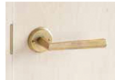
[Lever Handle] Hexagon + [Plate] Circle w136xh19xd55.5mm Code LH-RM

Combine a selection from 4 types of levers and 3 types of plates. * The dimensions indicated are for the handles.