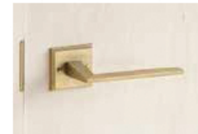
[Lever Handle] Line + [Plate] Square w134xh19xd56mm Code LH-SS