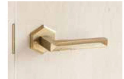
[Lever Handle] Hollow + [Plate] Hexagon w133xh18xd48mm Code LH-KR