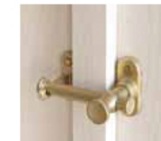
Flat Long w69xh42xd47.5mm Code AD-FL