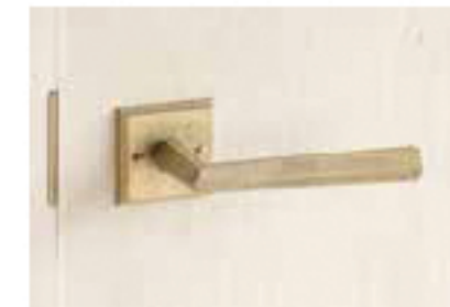
[Lever Handle] Hexagon + [Plate] Square w136xh19xd55.5mm Code LH-RS