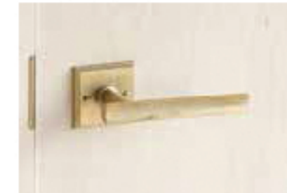
[Lever Handle] Curved + [Plate] Square w135xh20xd49mm Code LH-HS