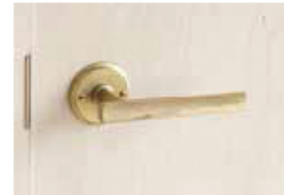
[Lever Handle] Curved + [Plate] Circle w135xh20xd49mm Code LH-HM