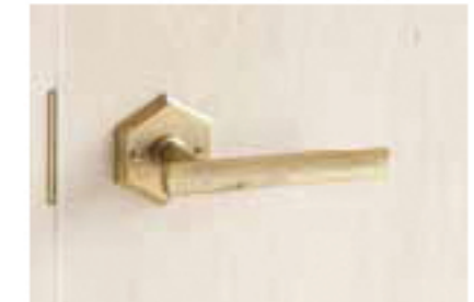
[Lever Handle] Curved + [Plate] Hexagon w135xh20xd49mm Code LH-HR