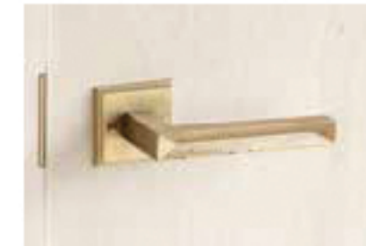
[Lever Handle] Hollow + [Plate] Square w133xh18xd48mm Code LH-KS