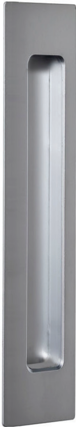
Right Hand Pull showing, also available Left Handed

BN : Brushed Nickel KC : Black Chrome BSC : Brushed Satin Chrome PB : Polished Brass DB : Dark Bronze PC : Polished Chrome EBA : Electro™ Black Ace PN : Polished Nickel EDB : Electro™ Dark Bronze SC : Satin Chrome EMB : Electro™ Medium Bronze WHT : Appliance White