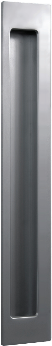
Left Hand Pull

BN : Brushed Nickel KC : Black Chrome BSC : Brushed Satin Chrome PB : Polished Brass DB : Dark Bronze PC : Polished Chrome EBA : Electro™ Black Ace PN : Polished Nickel EDB : Electro™ Dark Bronze SC : Satin Chrome EMB : Electro™ Medium Bronze WHT : Appliance White