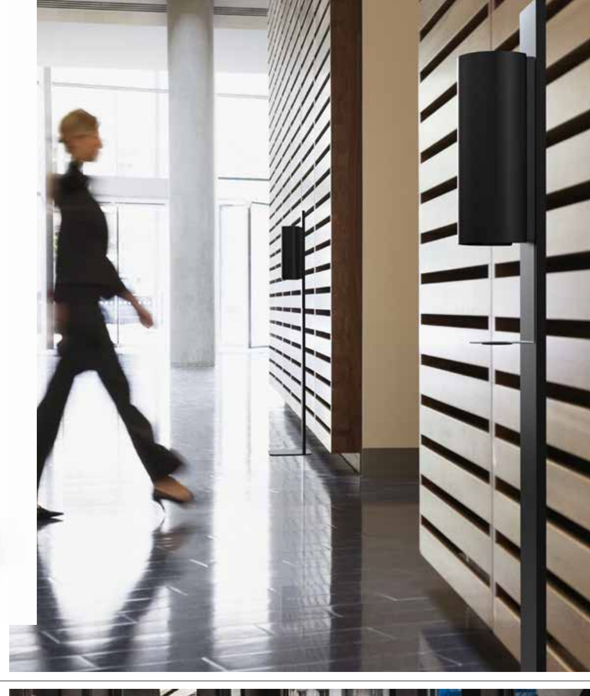
TABLE DISPENSER STAND