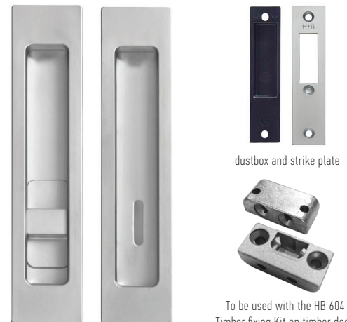
dustbox and strike plate