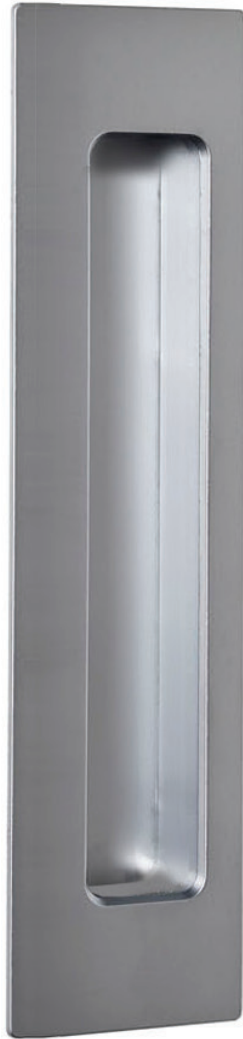
Right Hand Pull showing, also available Left Handed

BN : Brushed Nickel KC : Black Chrome BSC : Brushed Satin Chrome PB : Polished Brass DB : Dark Bronze PC : Polished Chrome EBA : Electro™ Black Ace PN : Polished Nickel EDB : Electro™ Dark Bronze SC : Satin Chrome EMB : Electro™ Medium Bronze WHT : Appliance White