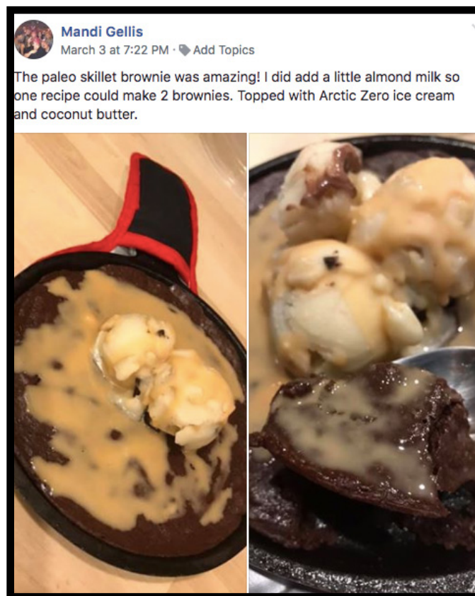
Our brownie skillet pairs so well with vanilla ice cream! Mandi G. knows what's up!