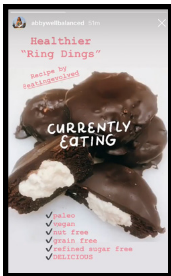
@abbywellbalanced made our paleo & vegan Ring Dings

Thanks to everyone who tries to replicate our recipes, they always turn out looking amazing!