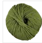
488.082 Moss Green 2