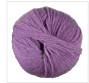
488.063 Orchid Purple 3