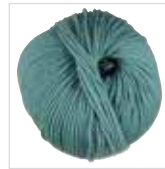
488.072 Dark Teal 1